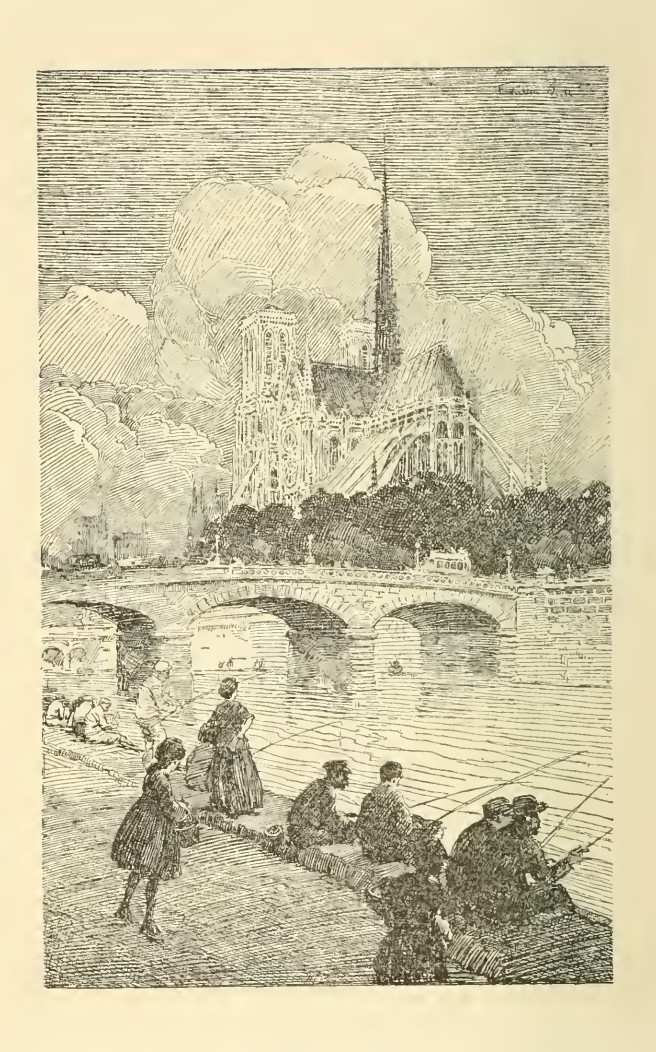
Univ Calif - Digitized by Microsoft ®