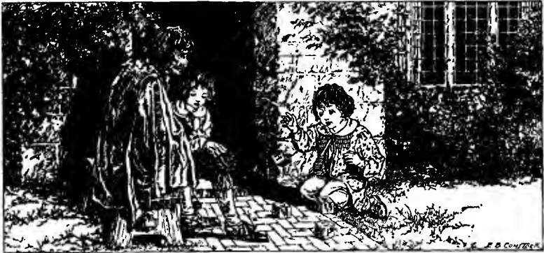
John Locke taught spelling by means of dice with letters of the alphabet pasted on them. (See Reading Assignment for October 28th.)

Read from BURNS' POEMS. . . . . Vol. 6, pp. 110-119