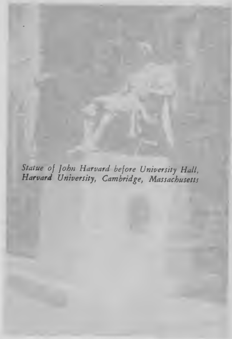
Statue of John Harvard before University Hall, Harvard University, Cambridge, Massachusetts