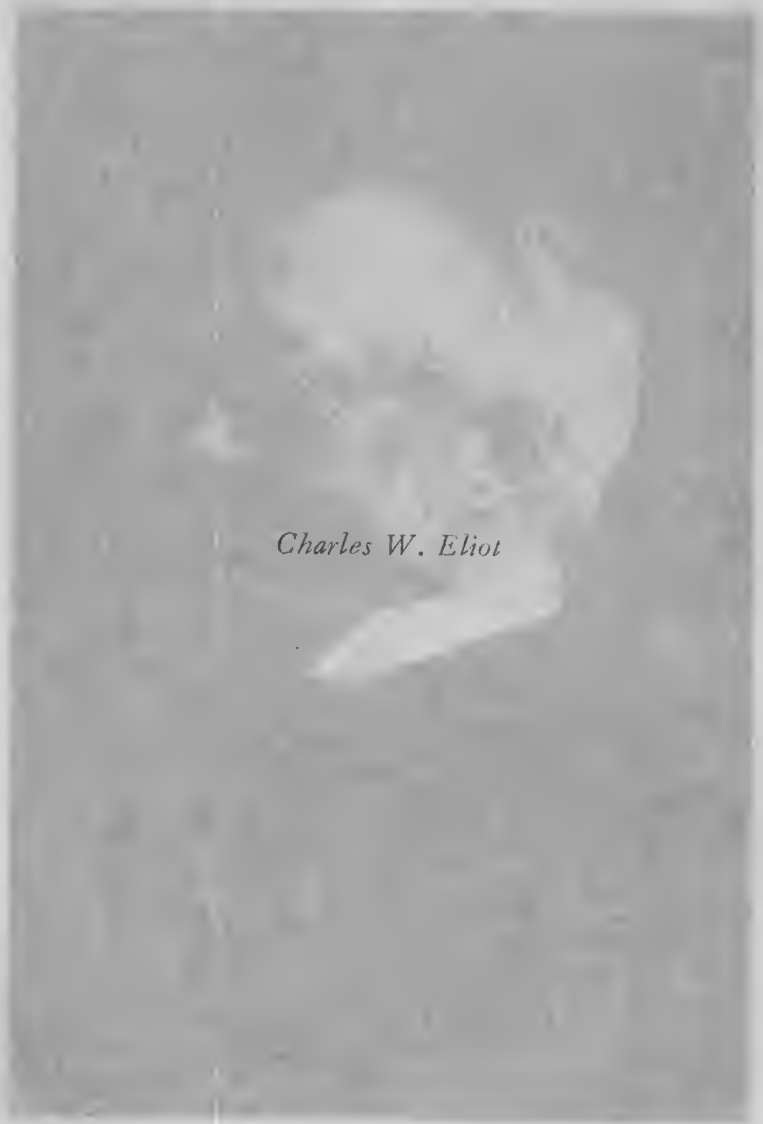
Charles W. Eliot