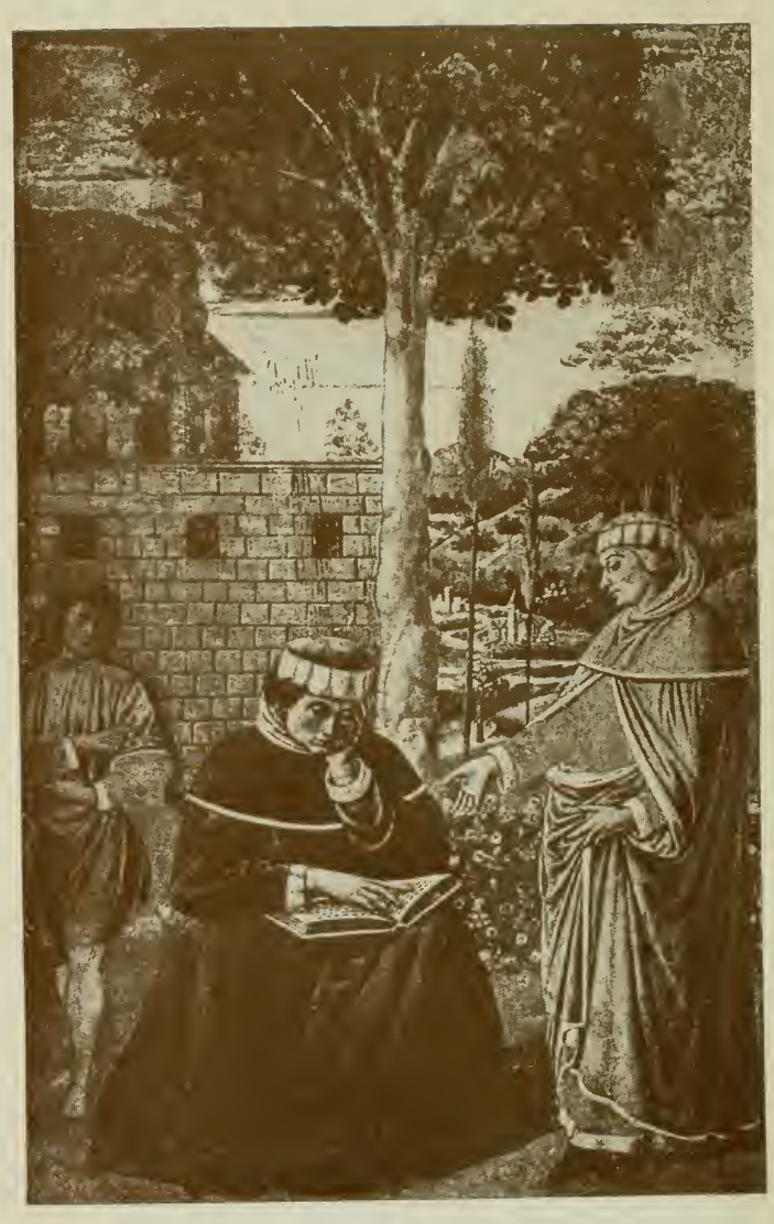
St. Augustine Reading From a fresco by Benozzo Gozzoli