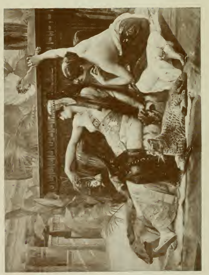
Cleopatra. From the painting by Alex. Cabanel