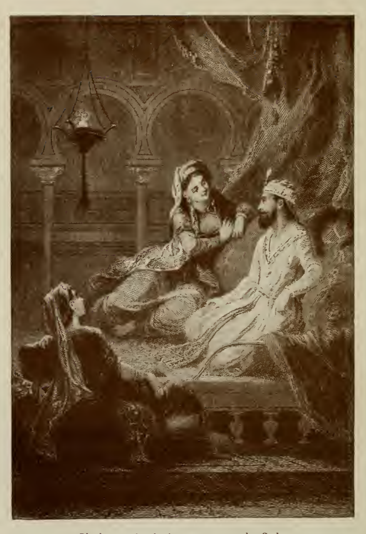
Shahrazad relating a story to the Sultan