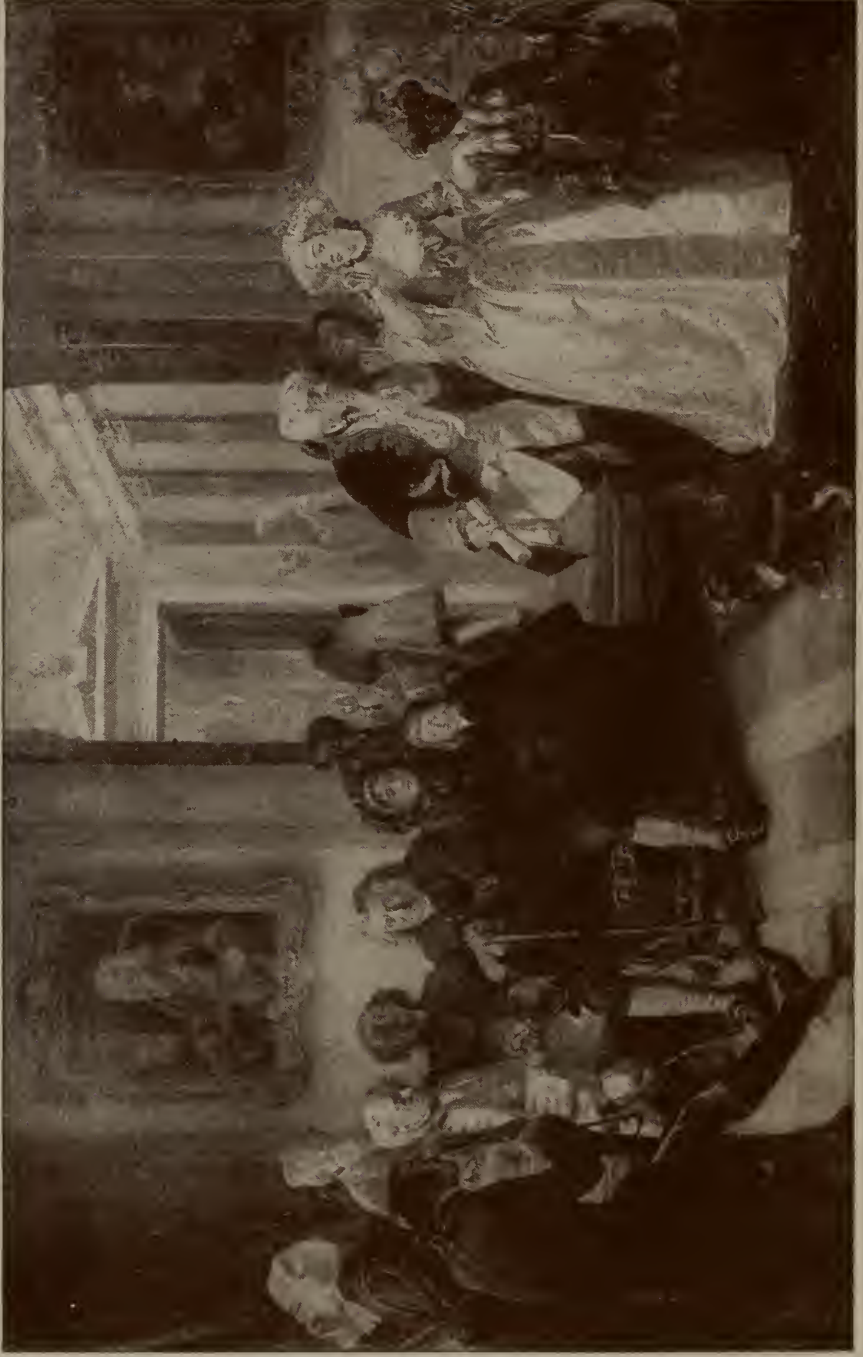
Samuel Johnson at the house of Lord Chesterfield