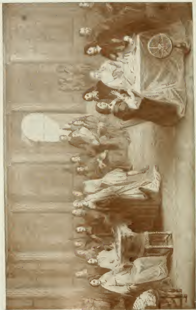
Queen Christine of Sweden Listening to a geometrical demonstration by Descartes — From the painting by Duménil