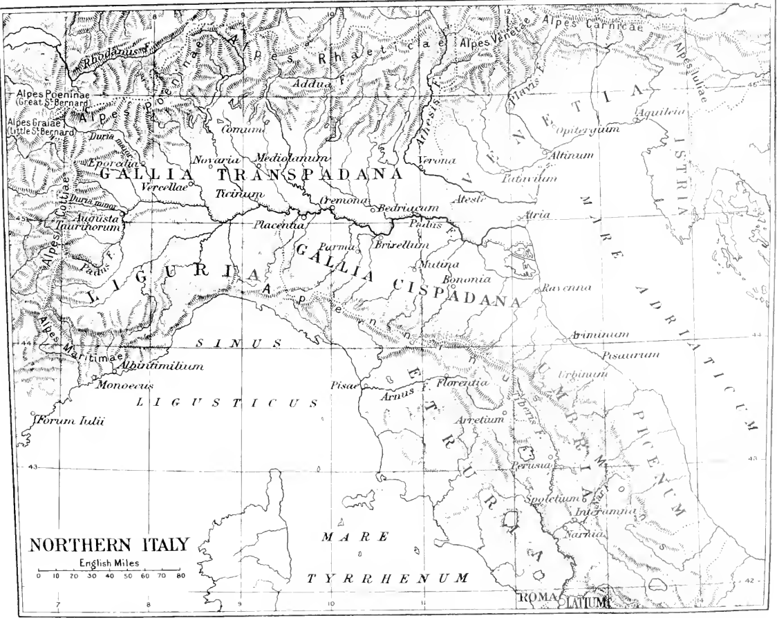
Edward Stanford Ltd., London