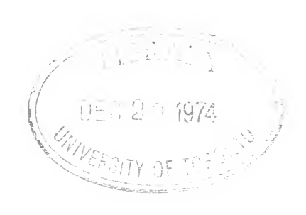
First printed 1933 Reprinted 1951, 1956, 1961, 1967