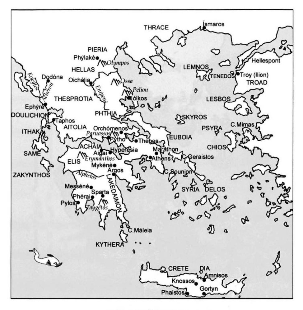
Greece and its environs