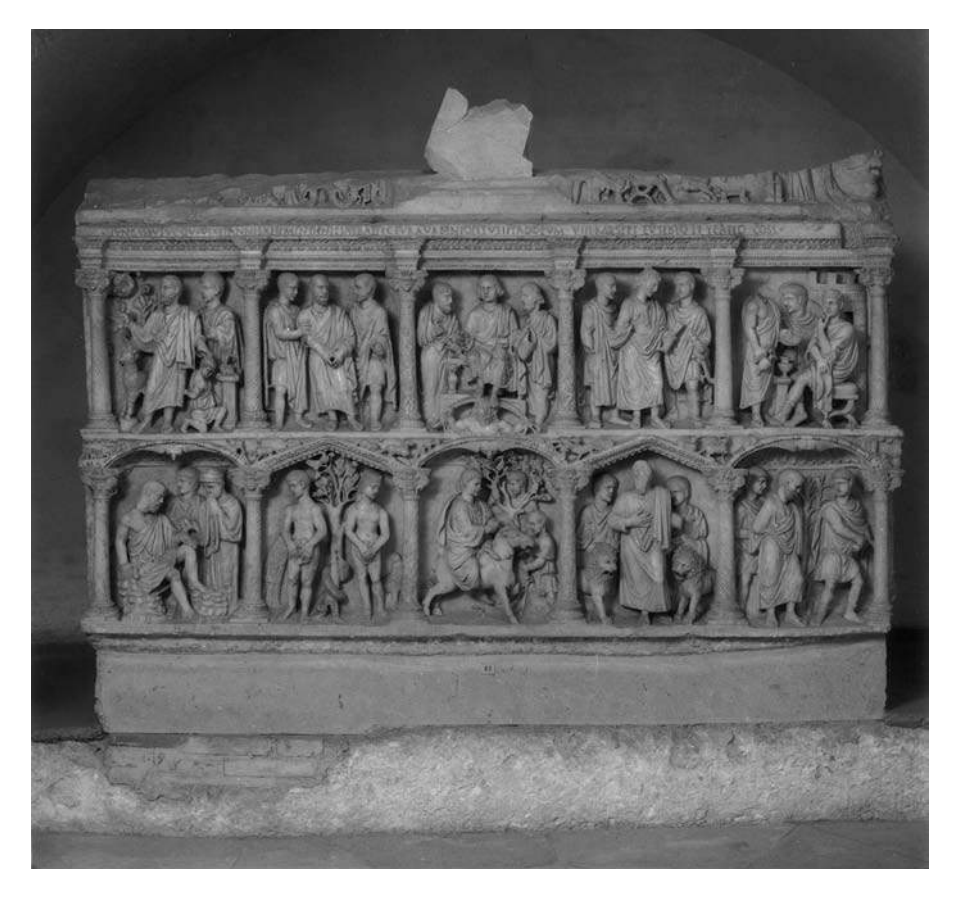
Figure 21.3 The sarcophagus of Junius Bassus from Rome. Marble, AD 359. This is a grand double register sarcophagus with Old and New Testament scenes in the intercolumniations. St Peter's Basilica, Rome.

Here, far from directly relating to the elegantly executed imagery of an unusually grand sarcophagus in the way the Aper poem plays off the iconography of his monument, the two inscriptions (prose and verse) strike different but equally personal notes that contrast with the universal Christian message of the visual imagery. Bassus the man is given his curriculum vitae and his dates in the prose inscription on the rim, while the poem elevates him through its spectacular imagery of weeping into a paragon of the lamented deceased. The last two lines, elegantly alluding to Propertius 2.34.65 (on how all former writers should yield their place to Vergil) play on the pun in Bassus' name ('low' in colloquial Latin) by referring to the heights that must give way to him and the pinnacle he has achieved in death. Effectively, the personal and Rome-centred account of a dignitary who had proved a loyal servant to his city is used to supplement the Christian universalism of the main iconography. The literary genre of the epigram and its tropes, but also the very act of its epigraphic incision, work to provide a highly traditional