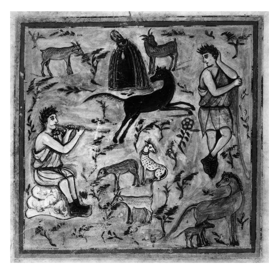
Figure 21.6 The Roman Vergil (Vatican Library, Vat. Lat. 3867), fol. 44v. Full-page miniature of herdsmen and flocks, one of two that served as the frontispiece for Georgics 3 . Last quarter of the fifth century AD.

Neptune whose statue can be seen in the doorway, and above this the temple of Minerva to which the snakes escape at 2.225–8. This imagery closely follows the text of 2.201–2, with the vividness of mactabat (he slaughtered) perhaps justifying the unusual choice of showing the priest as actual bull-slayer. In the upper left are the two snakes approaching from the sea (as described at 2.203–9), while in the right foreground – in heroic nudity, billowing cape and larger scale – a bearded and long-haired Laocoon and his two sons are killed by the snakes (as described at 2.209–24). The miniature closely follows the text (and its artist provides helpful labels for the figures, just in case) and yet it transforms it radically. We have two Laocoons now – bearded and beardless – rendering the narrative movement of the poem as a series of visual episodes, discrete from each other but united (i.e. discrete from other parts of the Aeneid 's text) by being in a single picture frame. Yet some parts even of Vergil's Laocoon account are