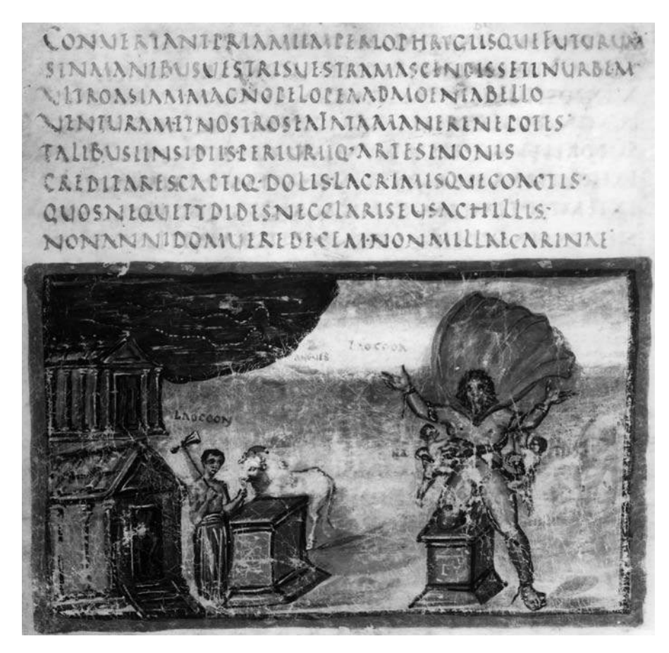
Figure 21.7 The Vatican Vergil (Vatican Library, Vat. Lat. 3225) fol. 18v. Full page with the text of Aeneid 2.191–8 and a miniature showing the story of Laocoon, described in Aeneid 2.201–24, which was written on the lost page opposite. First quarter of the fifth century AD.

conflated – such as the narrative of the snakes attacking the sons and Laocoon vainly attempting to rescue them, which has become a single iconic scene that may owe something iconographically to the famous marble group by Hagesander, Polydorus and Athenodorus mentioned by Pliny at Natural History 36.37 and either identical with or replicated by the statue found in 1506 and now in the Vatican.