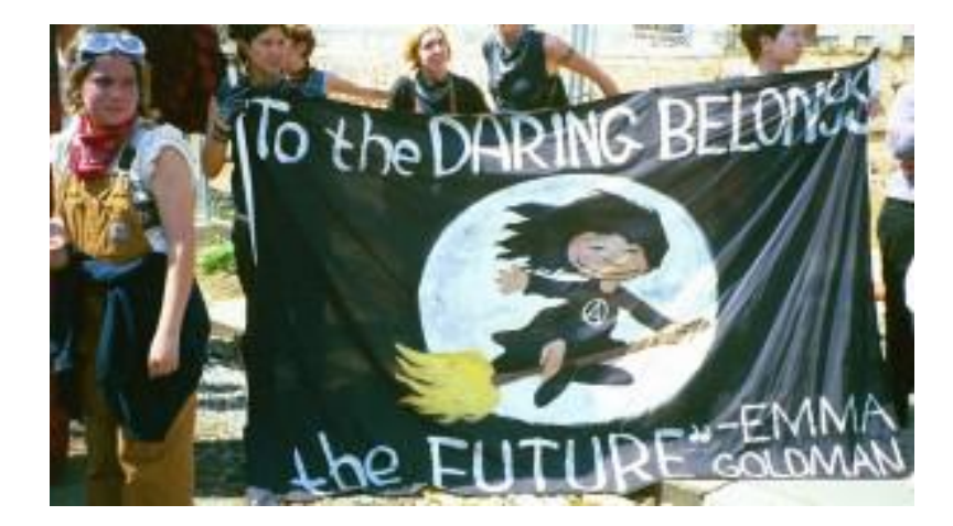
Anarcha-feminists at an anti-globalization rally and protest quote Emma Goldman

But even more striking is the conceptual convergence with the conception of freedom that I have described above. For instance, Kornegger affirms that "liberation is not an insular experience" because it can occur only in conjunction with all other human beings (ibid., 496), which, again, means that freedom cannot but be a freedom of equals. However, this also implies that one cannot fight patriarchy without fighting all other forms of hierarchy, be they economic or political. As Kornegger (2007:493) again put it, "feminism does not mean female corporate power or a woman president: it means no corporate power and no president."