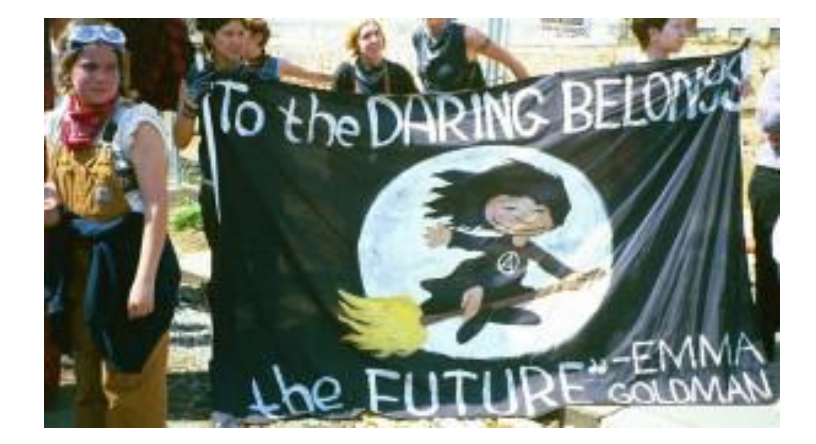
Anarcha-feminists at an anti-globalization rally and protest quote Emma Goldman

But even more striking is the conceptual convergence with the conception of freedom that I have described above. For instance, Kornegger affirms that "liberation is not an insular experience" because it can occur only in conjunction with all other human beings (ibid., 496), which, again, means that freedom cannot but be a freedom of equals.However, this also implies that one cannot fight patriarchy without fighting all other forms of hierarchy, be they economic or political. As Kornegger (2007:493) again put it, "feminism does not mean female corporate power or a woman president: it means no corporate power and no president."