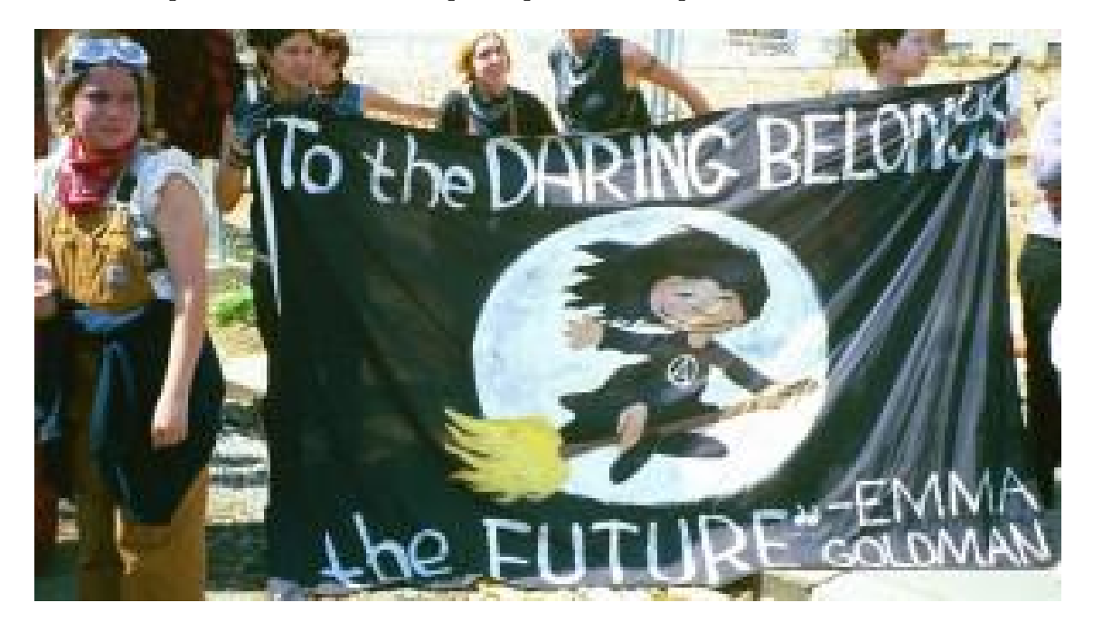
Anarcha-feminists at an anti-globalization rally and protest quote Emma Goldman

But even more striking is the conceptual convergence with the conception of freedom that I have described above. For instance, Kornegger affirms that "liberation is not an insular experience" because it can occur only in conjunction with all other human beings (ibid., 496), which, again, means that freedom cannot but be a freedom of equals.However, this also implies that one cannot fight patriarchy without fighting all other forms of hierarchy, be they economic or political. As Kornegger (2007:493) again put it, "feminism does not mean female corporate power or a woman president: it means no corporate power and no president."