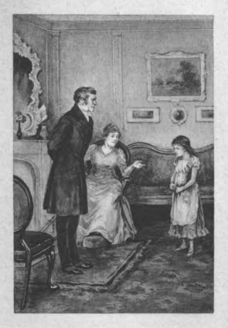
"This is the little girl."