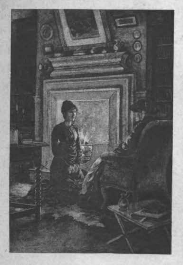
I knelt within half a yard of her.