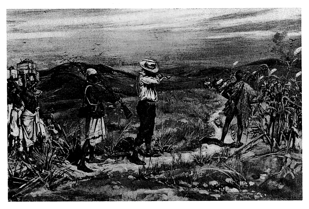
Illustration by A. D. McCormick after a sketch by Ewart S. Grogan, From the Cape to Cairo: The First Traverse of Africa from South to North, 1900.

control. He recommends forced labor for Africans, admires German colonial methods because they allow force, extends the application of Lord Salisbury's equation of "civilization" and "subjugation" from land to people (pp. 318–19). His model of empire also puts him in conflict with the Colonial Office, which, with "sickly, unreasoning philanthropy" (p. 358), imagines Africans have rights (that is, subjectivity) and fails to exercise British power. Grogan embeds this conflict in his statement of the purpose of the narrative: