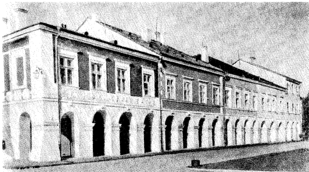
(a) Arcade in the main square of Zamość, Rosa Luxemburg's birthplace