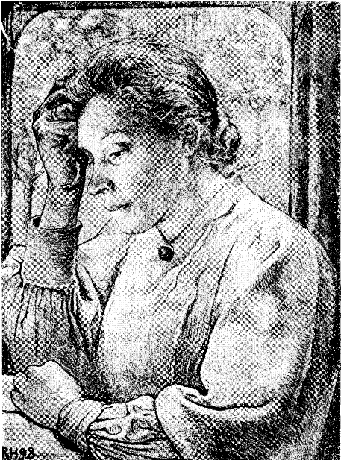
Henriette Roland-Holst, pencil sketch 1898