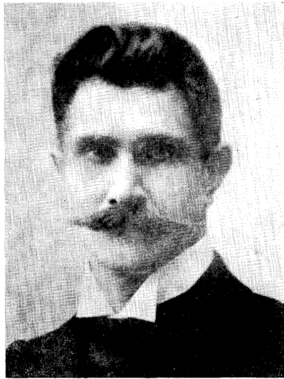
(b) Ignacy Daszyński