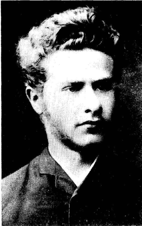
(a) Leo (Lev) Jogiches, probably before 1889