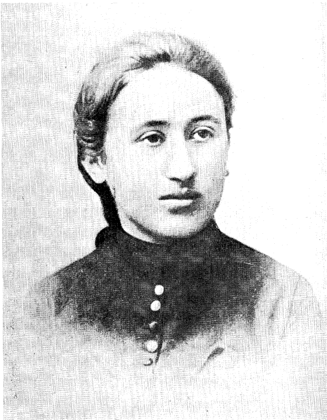
Rosa Luxemburg as a school girl