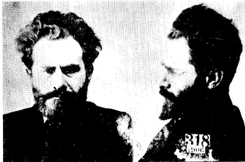
(b) Leo Jogiches, Warsaw 1906