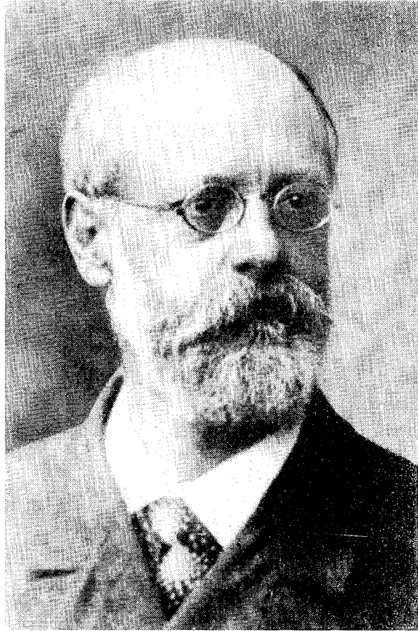
(a) Karl Kautsky