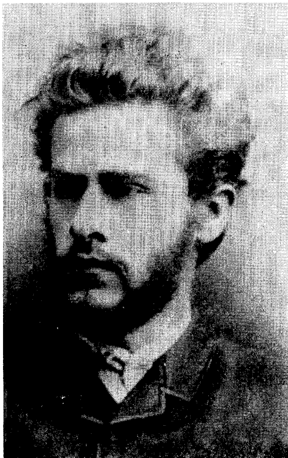
(b) Leo Jogiches as a student in Switzerland, between 1890 and 1898