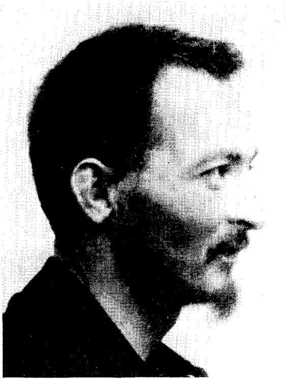
(a) Feliks Dzierżyński