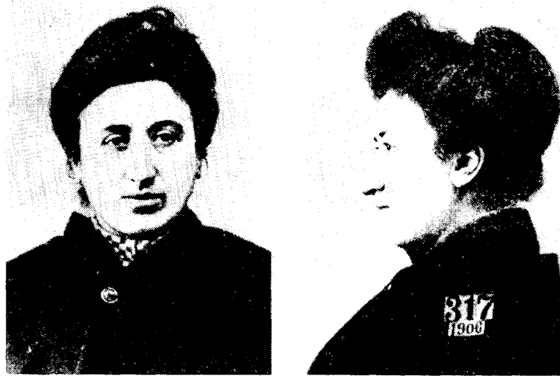
(a) Rosa Luxemburg, Warsaw 1906