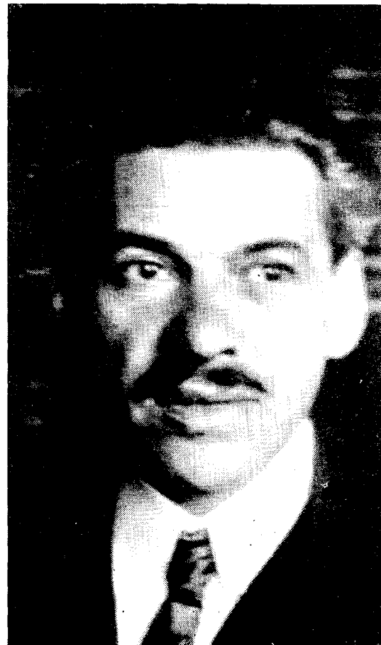
(b) Adolf Warszawski (Warski)