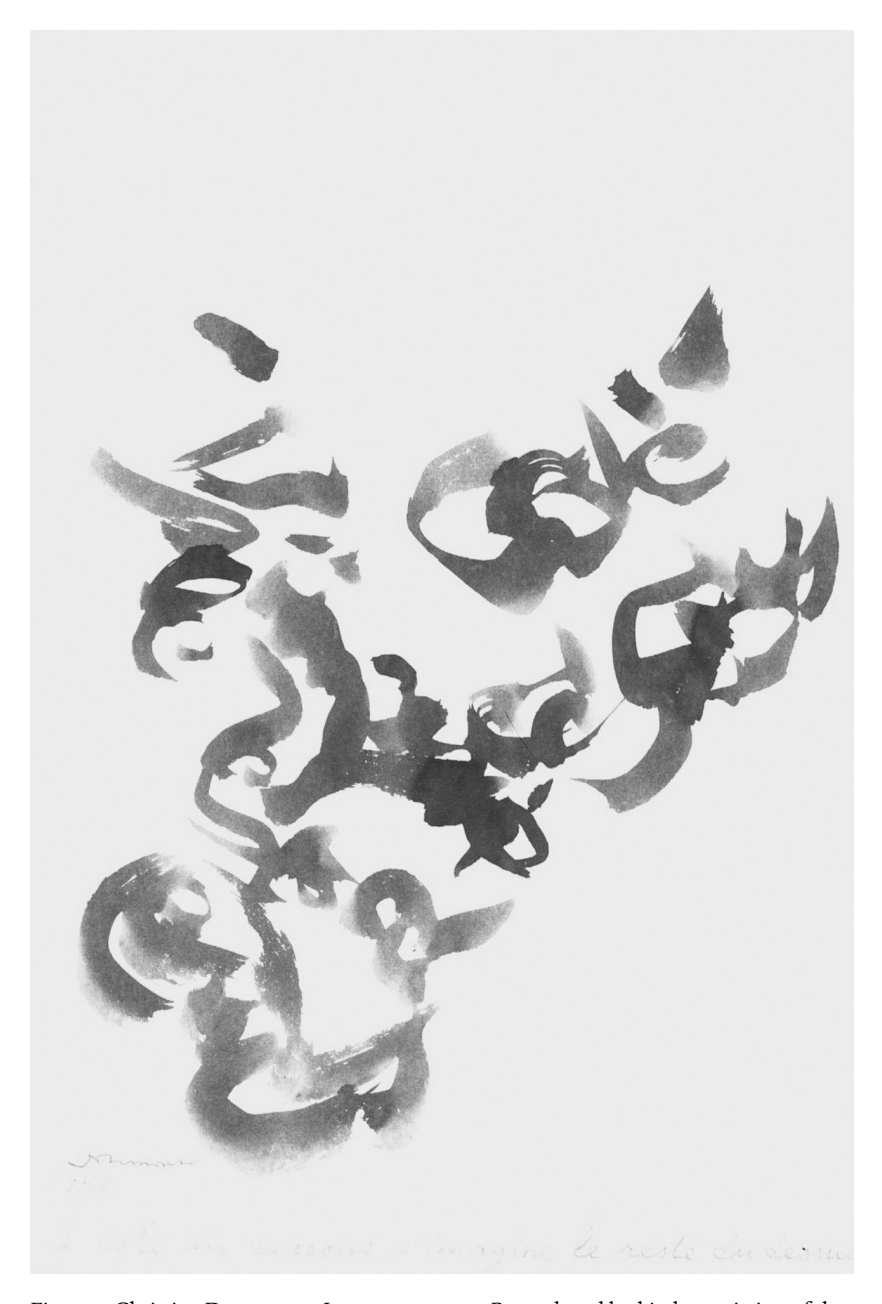
Figure 1 Christian Dotremont, Logogramme , 1977. Reproduced by kind permission of the artist.