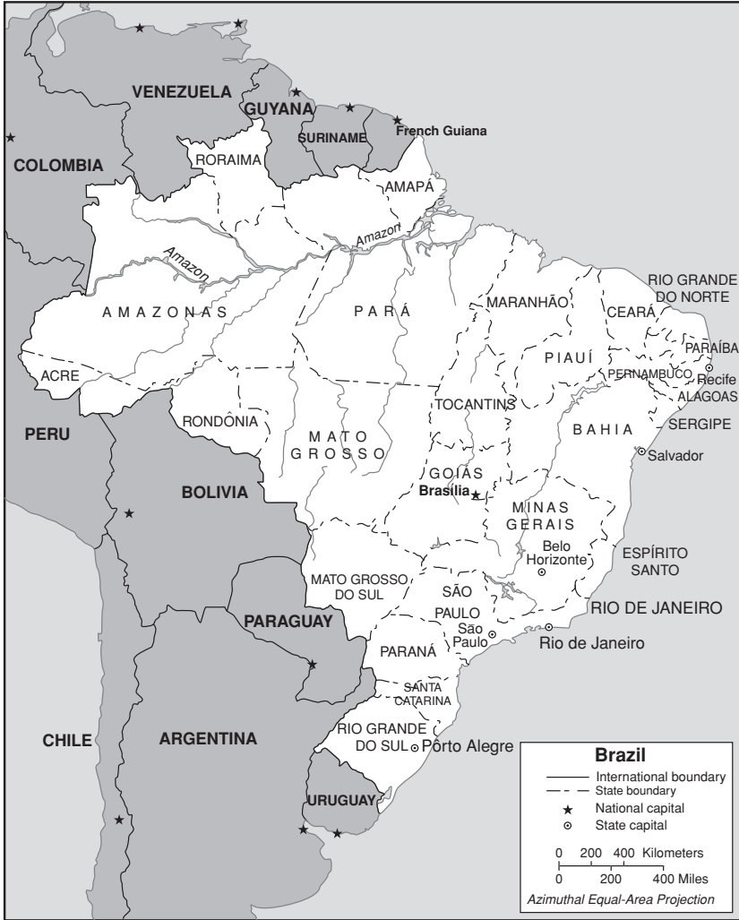
Map of Brazil in 2000