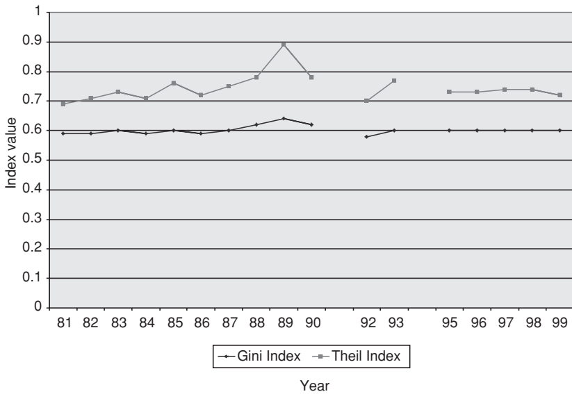
Figure 8.3 Inequality indices. Brazil: 1981–1999.

It is important to note that while there had been an increase of about 16 percent in the average (total) level of real earnings during the period 1981–1999, growth occurred only during the 1990s. In fact, between 1981 and 1990 there was actually a decline of a little over one percent, which was then compensated for by a rise of 17 percent between 1990 and 1999. In the 1980s, all occupational groups suffered a fall in real earnings, with two exceptions: proprietors/employers and self-employed businessmen. And even here the gains were modest: 1.6 percent and 1.3 percent, respectively. It certainly was a ‘lost decade’ in terms of the real earnings of the population as a whole. This particularly sombre picture for the 1980s changed significantly, however, in the following decade. There was a general growth in real earned income, with only two groups – street traders (–5.8 percent) and supervisors of manual work (–5.0 percent) experiencing a fall. Owing to the fact that some occupations at the bottom of the pyramid linked to services (especially in the traditional female niche areas, such as domestic employment and workers in social services) experienced quite substantial gains, far higher than those obtained at the top, we find a very substantial reduction of inequalities in average earnings between different occupational strata. There was at the same time a significant reduction in the income differences between genders. Between 1981 and 1990, female earnings grew