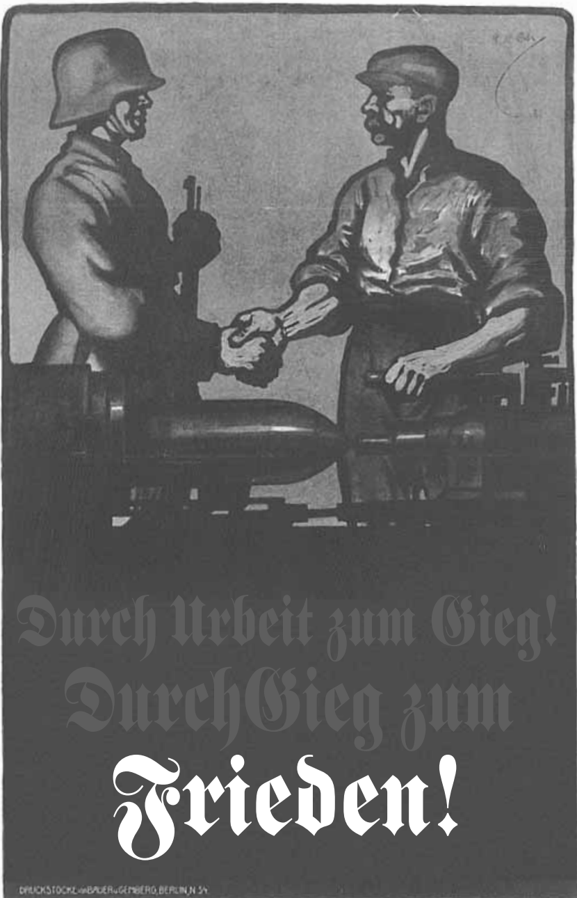
7. "Through Hard Work to Victory. Through Victory to Peace." Poster by A. M. Cay, published by the government in 1918