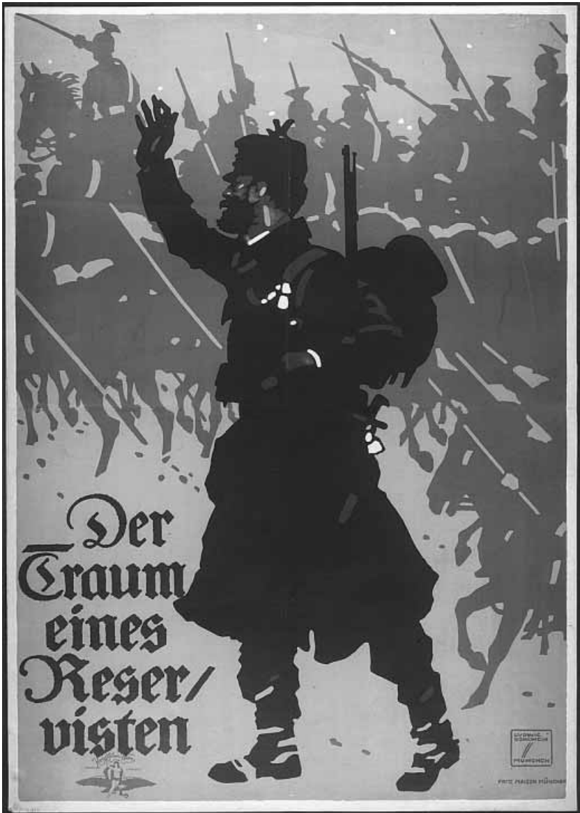
9. “The Day-Dreams of a Reservist.” Poster by Ludwig Hohlwein for a film with this title from late 1914