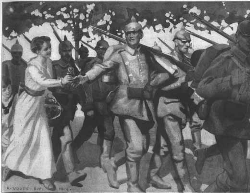
3. Drawing of troops marching to the front by R. Vogts for the Berliner illustrierte Zeitung , 6 September 1914, p. 651

Kaiserslautern, Zweibrücken, Worms, Homburg, Düsseldorf, Cologne, Strasburg, and elsewhere crowds of curious women greeted the first trains filled with prisoners of war just as they had the departing soldiers, giving flowers and Liebesgaben to the vanquished warriors. In Stuttgart some women even called up the government to ask where they could find prisoners to bring flowers. 38 This positive attitude towards prisoners of war took place only in western Germany, and largely toward French