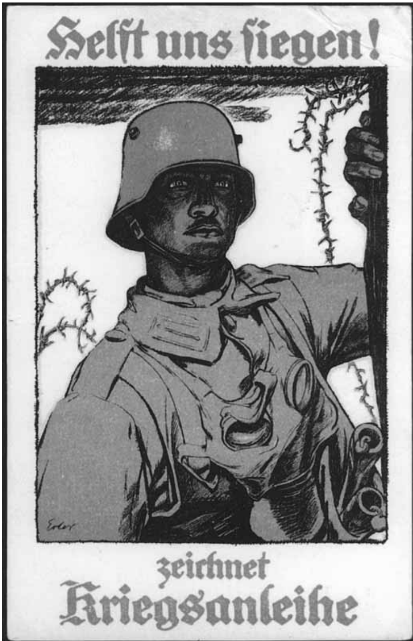
8. “Help us Win. Subscribe to War Loans.” Poster by Fritz Erler for the sixth war-loan campaign in 1917