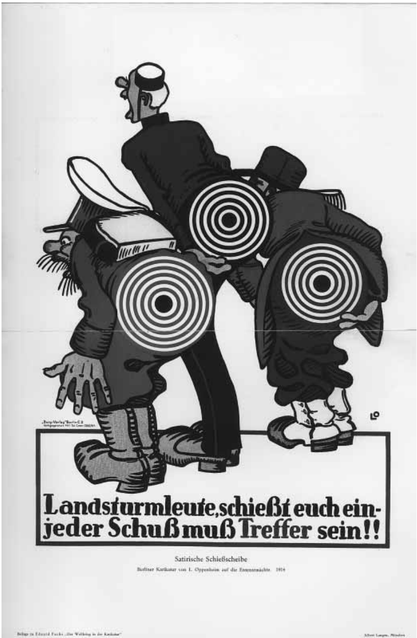
4. "Humorous" postcard by Louis Oppenheim from 1914