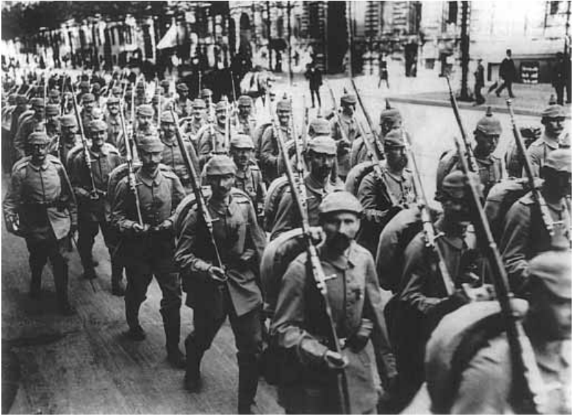
2. Troops marching through Düsseldorf in August 1914 on their way to the front

Toward the end of the month the curious people turned their attention to the wounded. Around 15 August the first trains with wounded pulled into Berlin. As one Tägliche Rundschau journalist noted, “that pulls. One wants to see that. Chocolate and books are packed, roses are bought, bottles of wine put in paper bags.” 36 Crowds of thousands showed up at the train stations. A Münchener Zeitung journalist found all this undignified, complaining that the audience was looking down upon the injured “as if it were all simply a pleasant theater piece.” 37 Eventually the government took measures to shield the wounded from the curious, to keep the public out of the train stations where there were wounded.