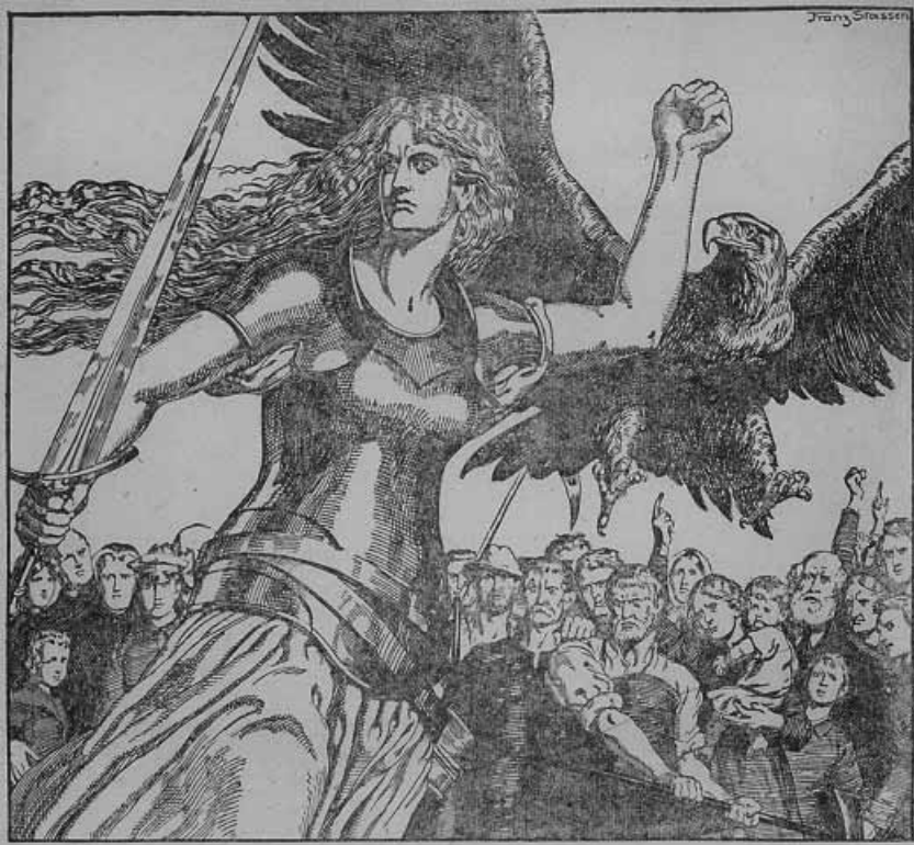
6. Graphics from the leaflet “To the German People ( An das Deutsche Volk ),” published by the government in December 1916

The images of the August enthusiasm published at the beginning of the war depict a moment of great festivity. (In 1914 the visual imagery of the August enthusiasm was developed independently of the government; it was the result of the effort of publishers, especially those who printed postcards, to make money out of the Great Times. 52 The government, charging that such advertising methods were beneath it, did not become involved in visual propaganda until 1916.) There are happy soldiers parading, happy soldiers on trains leaving (see illustration 5). Seldom is there any depiction of grim determination, except in an allegorical form, in the imagery of the furor teutonicus . Yet, as with the popular plays