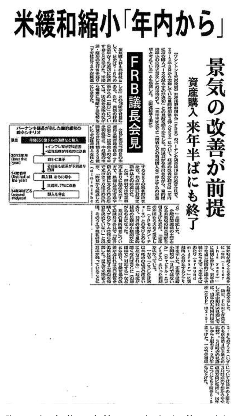
Figure 3. Sample of in-text double-presentation.