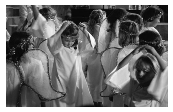
Figure 1 Children dress up as angels for a nativity play.

in angels seems not quite respectable. Yet these ethereal beings are now the subject of innumerable references, depictions, and allusions in the electronic ether. At the time of writing, an Internet search for 'angel' registered 287,000,000 hits, which was, for example, five times as many as 'Christianity' and six times as many as 'astronomy'.