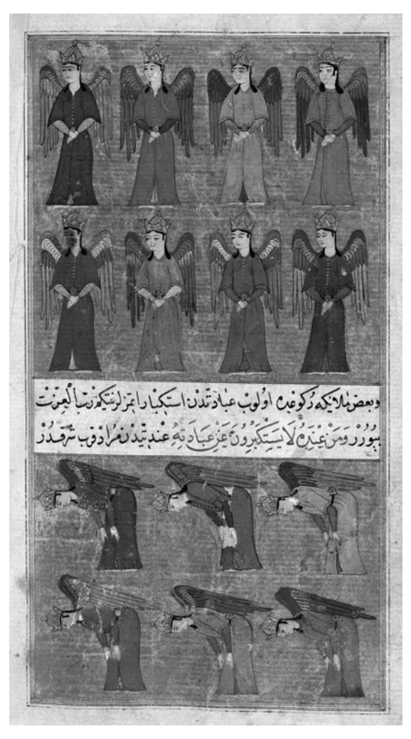
Figure 7 In the Quran the angels bow down to worship God.