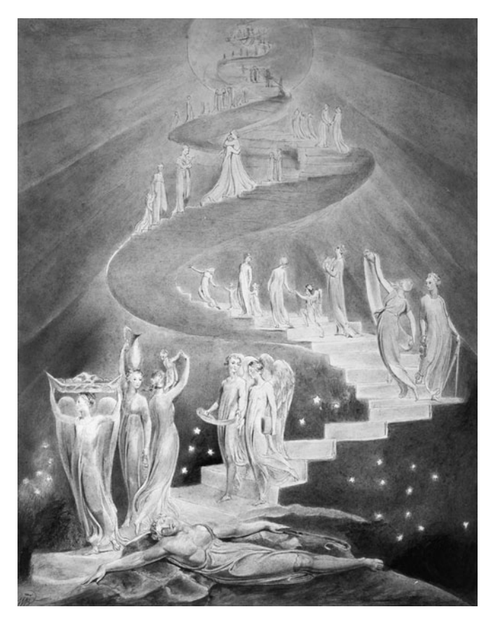
Figure 12 William Blake's portrayal of Jacob's ladder.