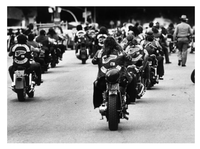
Figure 15 Hells Angels take their name from rebel or fallen angels.

regarded as altogether innocent or healthy. They commonly foster excessive risk taking, substance abuse, criminality, suicide, and other forms of self harm.