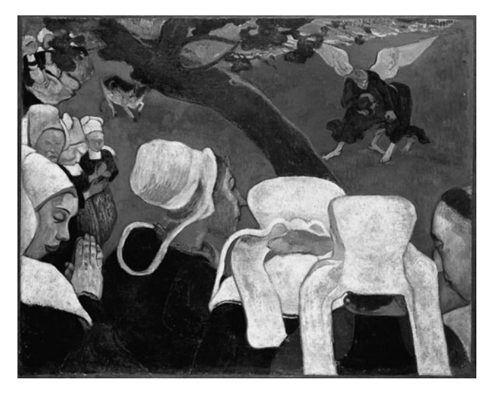
Figure 16 Gauguin painted a group of women remembering a sermon of Jacob wrestling with the angel.

as an angel who crashes through a ceiling. Wrestling with Angels is also the title of a book by Rowan Williams, the Archbishop of Canterbury. It is subtitled Conversations in Modern Theology .