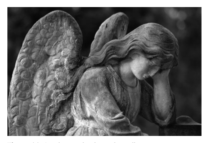
Figure 11 Angels are a familiar sight in Christian cemeteries.

and Islam, angels are not the souls of dead people. Angels are a different kind of creature altogether. Angels are not born and do not die. They do not live the fleeting transient life of human beings. They stand more above time than in time. Neverthe less, there is clearly something in common between human beings and angels, and especially between good human beings who have died and good angels who are in heaven. Jesus himself says that, in the resurrection, people 'cannot die any more, because they are like angels' (Luke 20: 36).