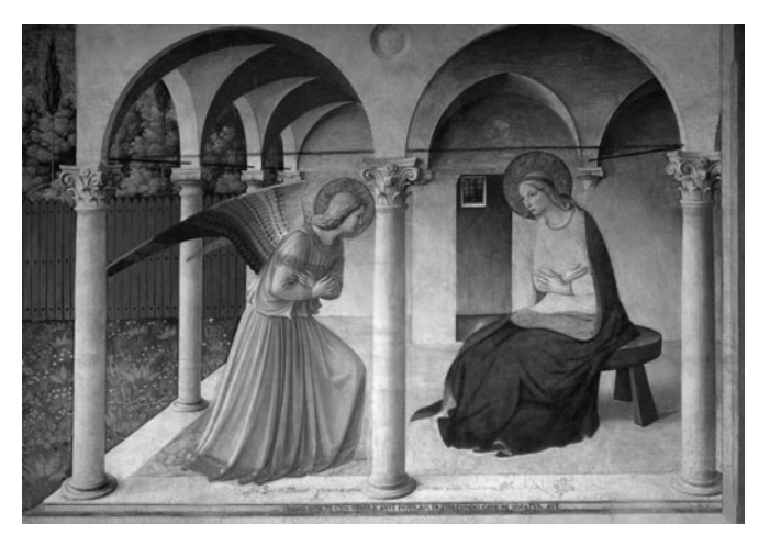
Figure 9 The Annunciation (here by Fra Angelico) was a favourite subject for Christian artists.

slightly pointing inwards. This gesture suggests humility, as if to say, 'how can this be?', but it is not a picture of doubt but of acceptance: 'let what you have said be done to me.' While Mary seems still, the figure of Gabriel in contrast is all activ ity, his hands are also crossed as a gesture of respect, but there is an urgency about the way the angel leans forward as though bursting to tell the news. The scene is sometimes portrayed as occurring in an enclosed garden, which symbol izes Mary's virginity. The artist struggles to capture a mood that is at once perplexed, accepting, and joyous. For Christians this is a key moment in the history of salvation. It is the moment when Jesus was conceived in Mary's womb and the Word was made flesh.