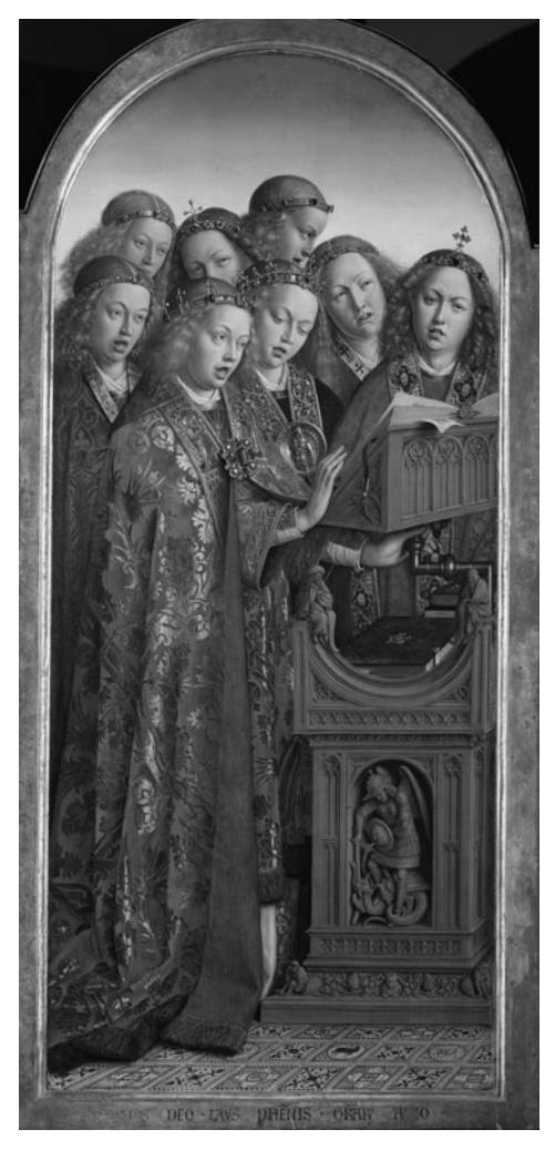
Figure 13 Jan Van Eyck's altar frontal in Ghent shows the heavenly choir singing, but without either wings or halos.