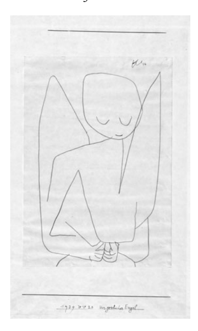
Figure 8 Paul Klee's For getful Angel (Vergesslicher Engel) is forgetful of his angelic nature but still exists somehow

we die. We eat to survive. When we eat, stuff goes into us, and when we breathe or sweat or go to the toilet, stuff comes out of us. We distinguish ourselves from each other by who our parents were and where we were born or brought up and what we do, but we also share a common humanity. If angels have no bodies, then none of this is true of angels. Angels are not born and do not die. They do not eat. They neither get fat nor lose weight. They have no weight. No angel is taller than another angel.