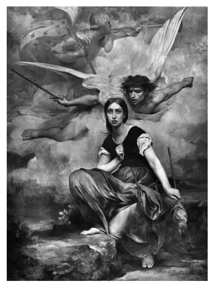
Figure 14 Joan of Arc here pictured with the Archangel Michael.