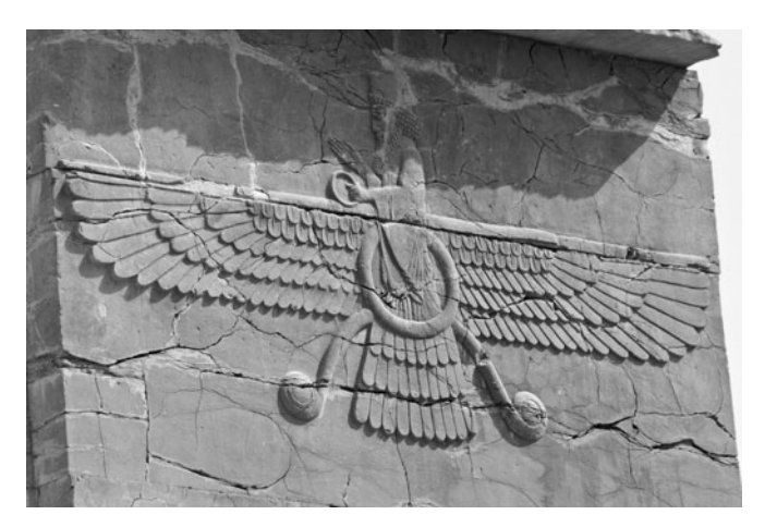
Figure 3 Faravahar is an ancient Zoroastrian symbol, but it came to represent an angelic being only in the nineteenth century.

God. In Hinduism, worship of many gods is compatible with belief in God. The gods are not rivals to the one God. The relationship is more subtle. In contrast, in Judaism, Christianity, and Islam, to worship 'other gods' is to turn away from the one God.