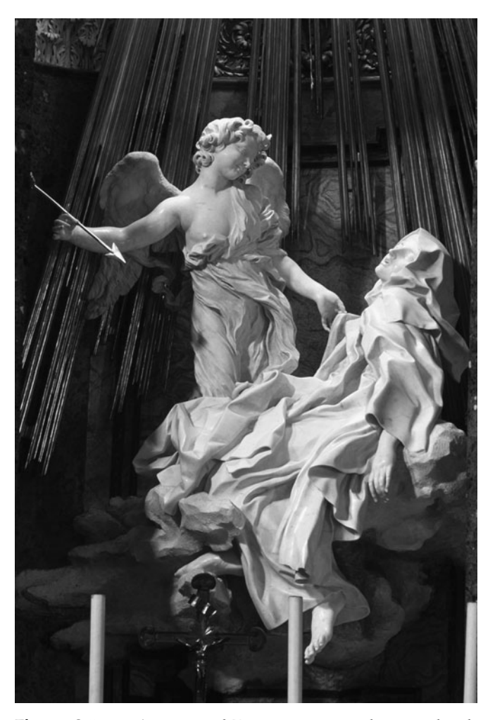
Figure 6 Bernini's statue of Teresa in ecstasy shows a cherub looking like Eros, the Greek god of love.