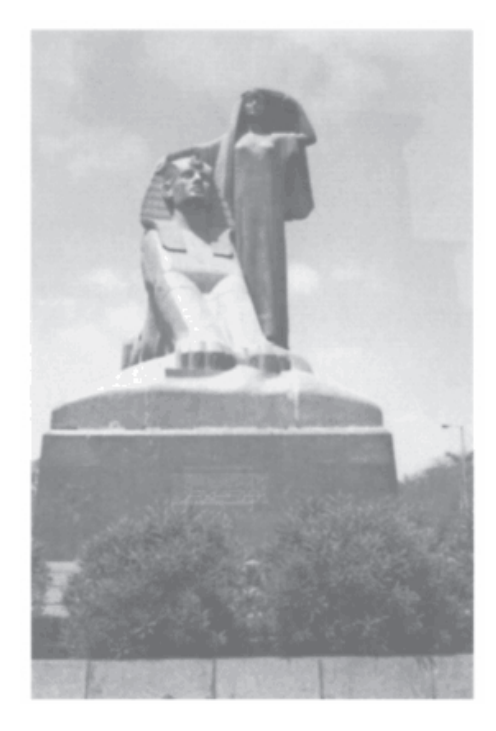
Figure 11.2 Statue of the "Renaissance of Egypt" (Nahdet Misr)