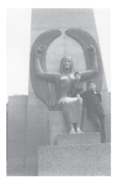
Figure 11.4 "Mother Egypt", the pedestal of the statue of Saad Zaghloul in Alexandria, Mahtet el-

Many Egyptians were swept up by the rhetoric of Arabism. For the young generations of Egyptians born after the revolution (1952) in the late 1950s and early 1960s, Egypt as Pharaonic Egypt was plotted out. However, identification with Arabism has never really penetrated the Egyptian "soul" remaining an official line especially because: (1) the Egyptians rarely trusted governments; (2) Abdel-Nasser's popularity was a result of his image as an antagonist of imperialism and corruption and not as a head of a government; (3) his policy of repression created a sense of fear and mistrust; (4) his denial of Egypt's nationalist history was disdained by the older generation (then in their forties to sixties, who were children or youths at the time of the 1919 revolt); (5) Egyptians use the word "Arab" to refer to Bedouin nomads or the inhabitants of the Arabian Peninsula; and (6) because Arab unity has never materialised due to rivalries, feuds, disputes and conflicts among "Arab" leaders, who were constantly creating barrages of verbal abuse on the air waves. Egypt under Nasser was also embroiled in a war in Yemen opposed by Saudi Arabia.