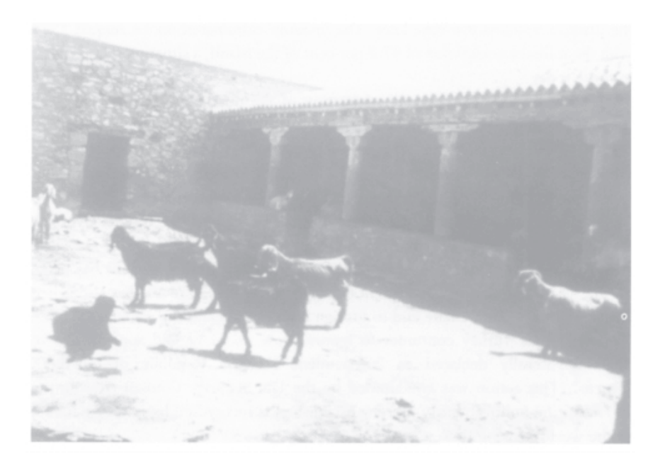
Figure 1.1 Monastery at Tochni, Famagusta district: destroyed and used as a sheepfold

The destruction of archaeological sites (see Figure 1.2) and the illicit trade of antiquities in the northern part of Cyprus has had dramatic and likely irreversible consequences, both for Cyprus' cultural heritage and for archaeological research on the island. Documents from the Turkish Cypriot (Yasin 1982) and foreign