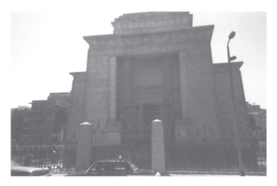
Figure 11.3 Mausoleum of Saad Zaghloul, Cairo

modern Egypt. The memories of Saad Zaghloul and Moustafa Kamil were overlooked. The political discourse that centered on Pharaonic Egypt was replaced with a discourse that placed Egypt within the folds of Arab nationalism.