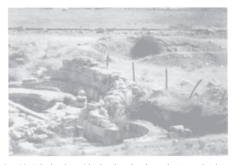
Figure 1.2 Archaeological site at Soloi, classical period: pipeline (conduits) running through site (Courtesy: Director of the Department of Antiquities, Cyprus)

Source: P.S.O'Keefe and L.V.Prott (1989) Law and the Cultural Heritage, Vol. 3, London: Butterworths.