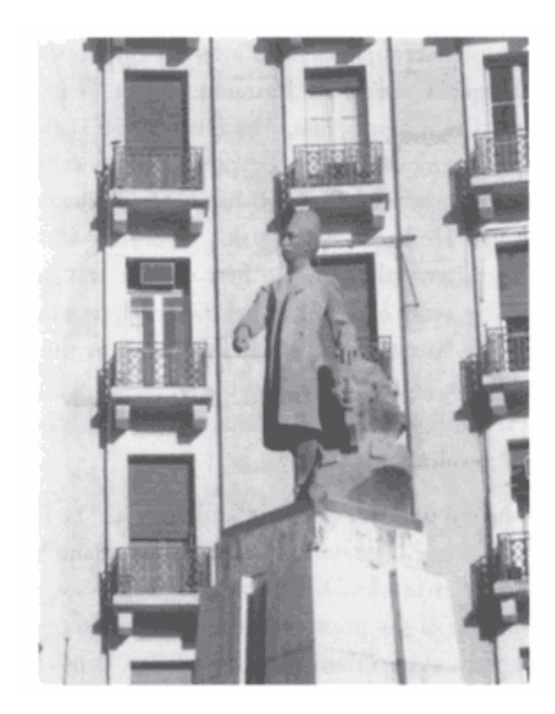
Figure 11.1 The statue of Moustafa Kamil in downtown Cairo

The unification of Copts and Moslems, of men and women, of workers, peasants and bourgeoisie was legitimated by an appeal to "eternal Egypt," "young Egypt" and, above all, Pharaonic Egypt. Poets such as Ahmed Shawki, Hafez Ibrahim, Ismail Sabry and Al-Baroudi began to invoke the pyramids in a genre of nationalistic poetry comparing Egypt's past glory with its impoverished present and extolling the Egyptians to restore and revive Egypt's ancient splendour and hegemony. Historical plays by Ahmed Shawki, the prince of poets, also invoked the Pharaonic heritage of Egypt as in his renowned work, Cleopatra , which became a favourite as a school play.