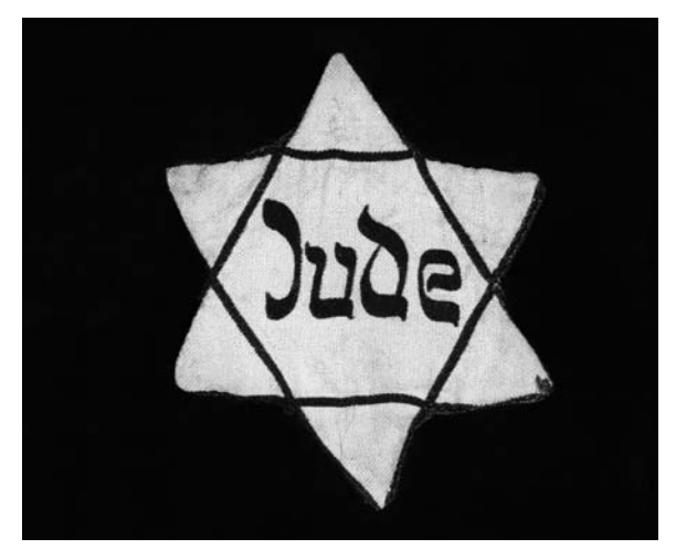
PLATE 13. Just as the Inquisition compelled its victims to wear cloth crosses, Nazi Germany revived the medieval "Jew badge" to identify and isolate the targets of the Final Solution.

PLATE 14. Like Galileo before the friar-inquisitors of the Roman Inquisition, Bertolt Brecht was subjected to interrogation by the House Un-American Activities Committee in 1947.