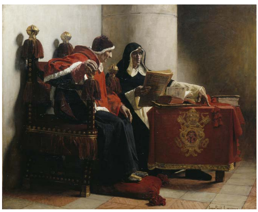
PLATE 6. Torquemada, clad in the cowled robe of the Dominican order and shown here in the company of Pope Sixtus IV, was the iconic grand inquisitor.

PLATE 5. Men and women accused of heresy were sometimes silenced with iron masks fitted with spikes or gags, like the "scold's bridle" shown here, a grim example of the torturer's art.