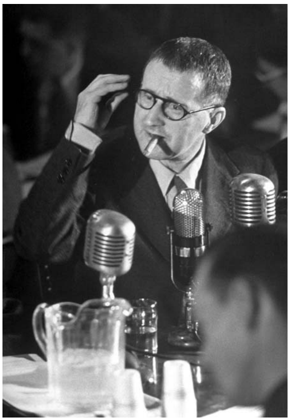
PLATE 14. Like Galileo before the friar-inquisitors of the Roman Inquisition, Bertolt Brecht was subjected to interrogation by the House Un-American Activities Committee in 1947.

PLATE 13. Just as the Inquisition compelled its victims to wear cloth crosses, Nazi Germany revived the medieval "Jew badge" to identify and isolate the targets of the Final Solution.