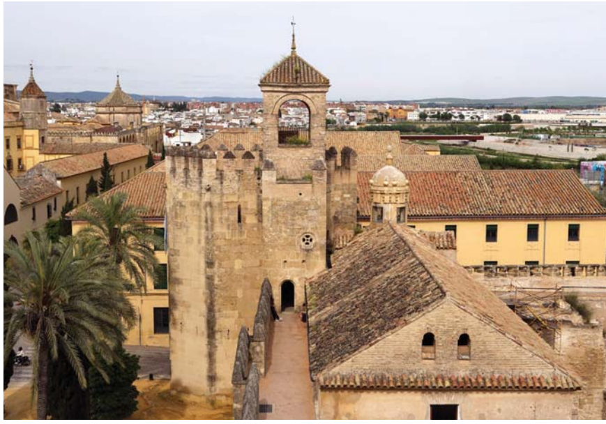
PLATE 7. "As if he were an entrepreneur offering a show," the grand inquisitor did not neglect the production values of an auto da fé like the one in Madrid in 1683. PLATE 8. Palaces and fortresses, such as the Alcázar at Córdoba, were commonly put at the disposal of the friar-inquisitors by compliant kings.