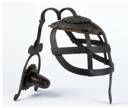
PLATE 5. Men and women accused of heresy were sometimes silenced with iron masks fitted with spikes or gags, like the "scold's bridle" shown here, a grim example of the torturer's art.

PLATE 6. Torquemada, clad in the cowled robe of the Dominican order and shown here in the company of Pope Sixtus IV, was the iconic grand inquisitor.