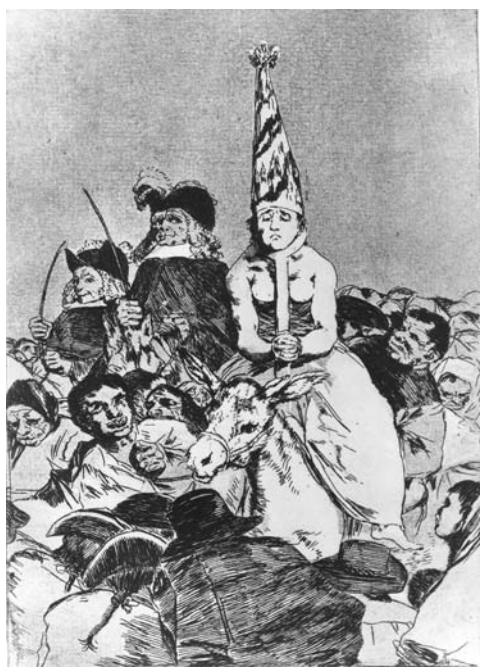
PLATE 9. The peaked headpiece known as a coroza, shown in a drawing by Goya, was a theatrical touch invented by the Spanish Inquisition to humiliate its victims.

PLATE 10. Critics of the Inquisition delighted in showing the sexual sadism of the friar-inquisitors, but the fact remains that the victims were stripped to facilitate the work of the torturer.