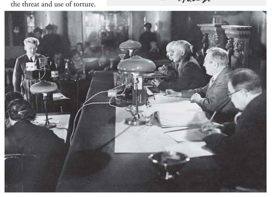
PLATE 12. The show trials of Stalinist Russia in the 1930s, like the Inquisition itself, demonstrated how innocent men and women could be reduced to abject confession by

PLATE II. The Spanish Inquisition turned heresy from a thought-crime into a blood crime, a deadly innovation embraced by Nazi Germany in the notorious Nuremberg Laws of 1935.