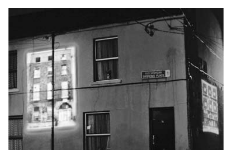
FIGURE 3. Esther Shalev-Gerz, Daedel(us) (2003).