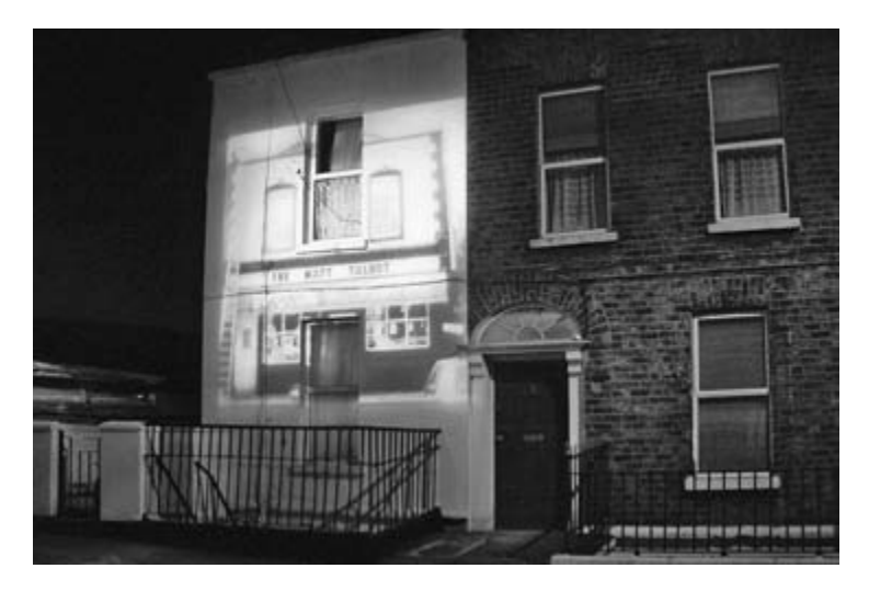
FIGURE 2. Esther Shalev-Gerz, Daedel(us) (2003).