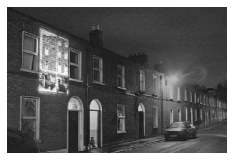
FIGURE 4. Esther Shalev-Gerz, Daedel(us) (2003).

memory. Quintilian, I imagine, would be turning in his grave. The project is representative of a new strand of Shalev-Gerz's work in which cross-border participation is proposed not as the response to trauma but as the preemptive fabric of daily, endlessly mobile life, a way of negotiating the margins of citizens and of identity in the modern world. The continuity with the earlier work is nonetheless clear. Memory must be kept moving, and links must continue to be forged between people with no reason to—with every reason not to—recognize themselves in each other.