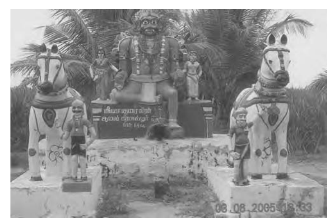
Madurai Veeran—folk deity at Tiruvannamalai outskirts.