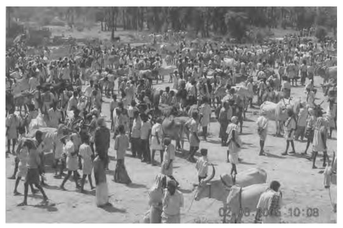
Cattle fair at Devanur, 20 kilometers from Tiruvannamalai.