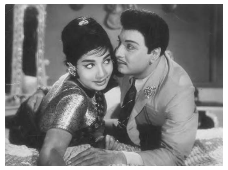
MGR and Jayalalitha in the film Mugarasi, produced by Chinappa Devar in 1966. Both the actors went on to become chief ministers of Tamil Nadu.