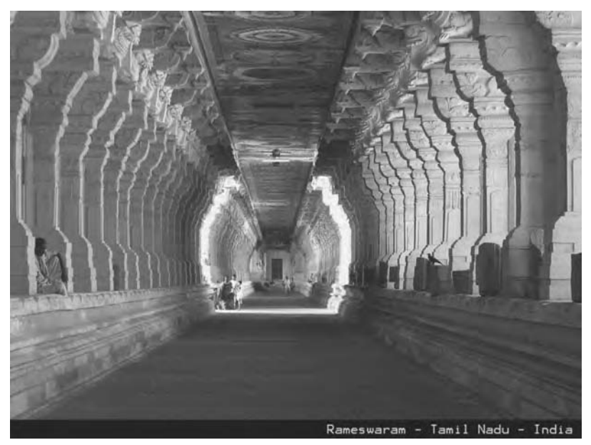
The Thousand Pillared hall at the Rameswaram Shiva temple a unique architectural creation.