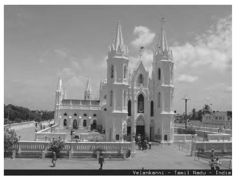
Velankanni Church of Mother Mary visited by Christians and non-Christians alike.