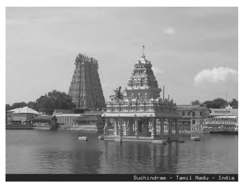
Suchindram Temple of Sthanunathar (Shiva) around ten kilometers from Kanyakumari, the southern tip of India.