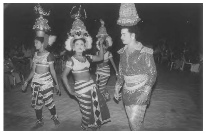
Traditional folk dance: Karaga Attam—dancing with pots.