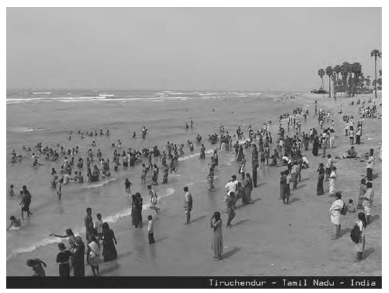
Hindus take a holy dip in the Bay of Bengal at Tiruchendur.