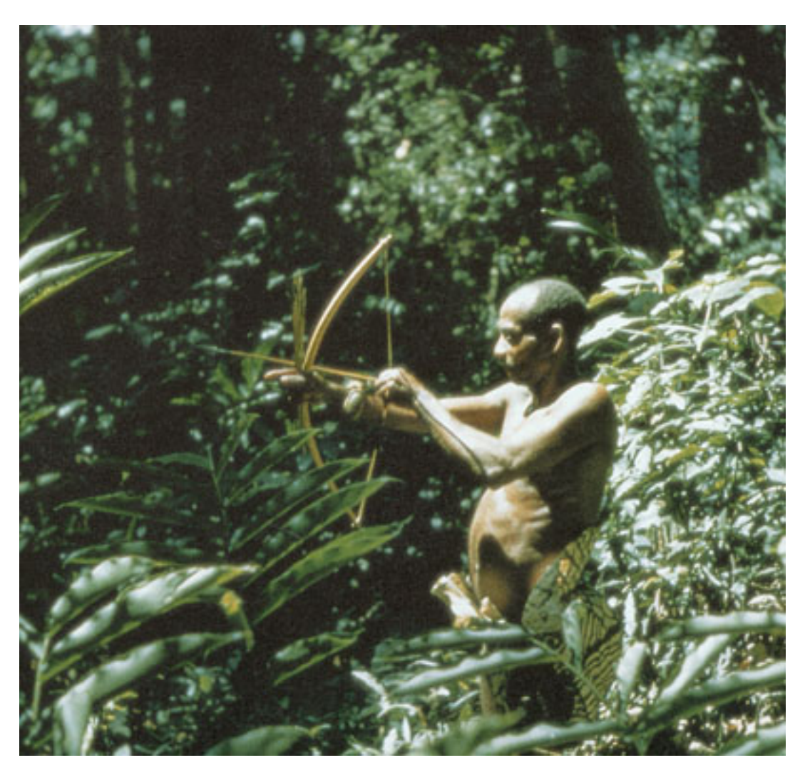
The Mbuti hunt with bows and arrows, as well as spears and nets.