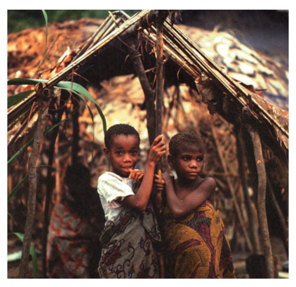
The Mbuti are one of many peoples who live in the Ituri rain forest.