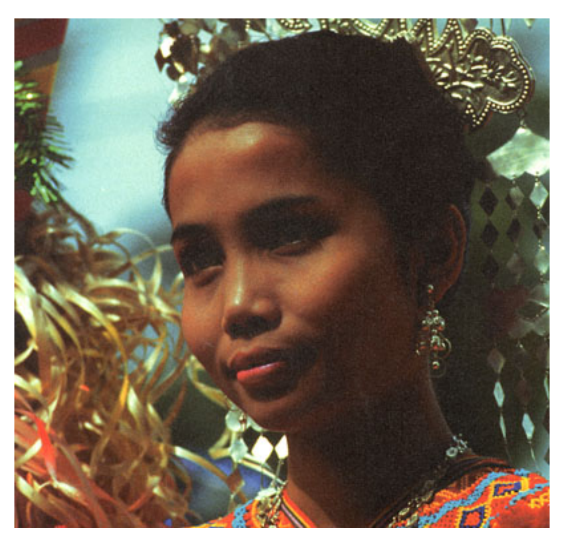
The Dayak show pride in their culture by wearing colorful traditional clothing for a celebration.