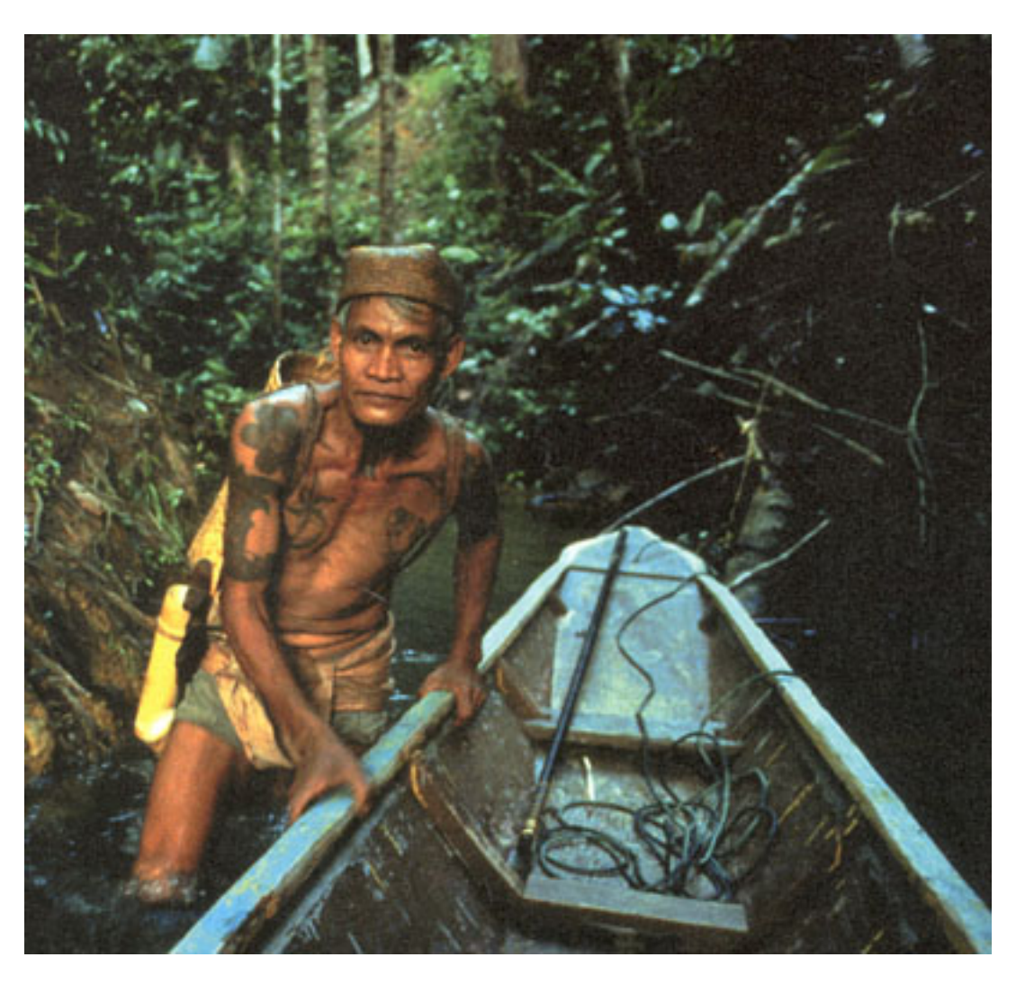
The Dayak also use canoes to travel on the rivers of Borneo.