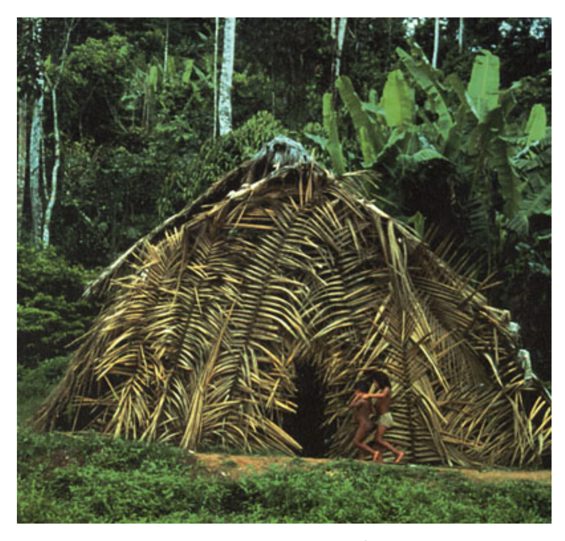
Huaorani homes are made from bamboo poles and leaves.