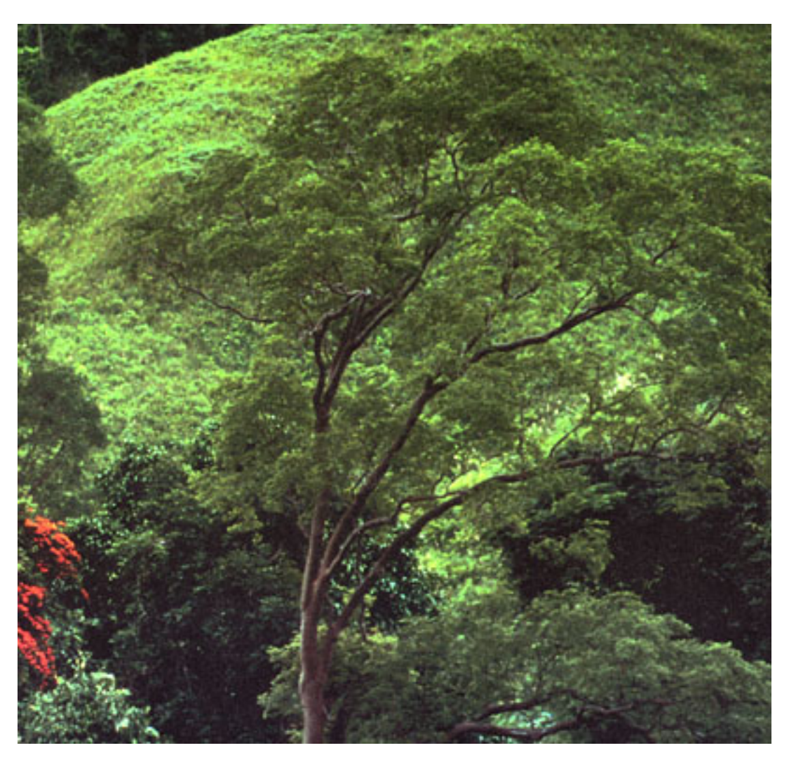
Rain forests are filled with a wide variety of trees and plants.