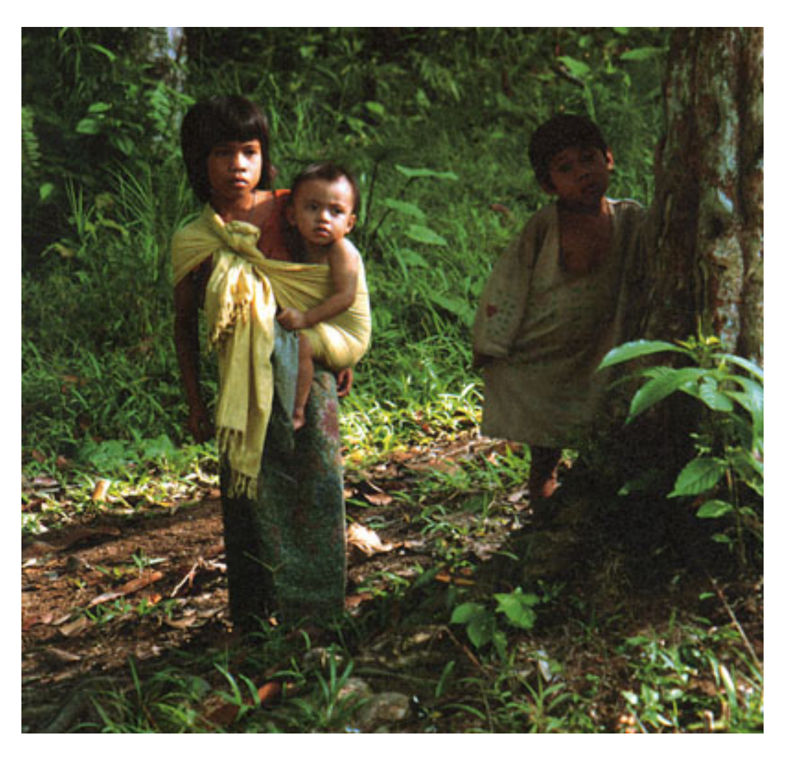
The Dayak weave cloth with pretty colors and patterns. The cloth is then made into clothes.