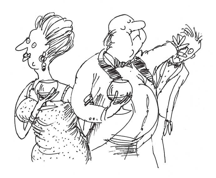
Big Bill was as broad as a barrel of beer; At bruising and boozing he hadn't a peer. A burly club bouncer he drubbed one and all Until clobbered and bashed in a brutal pub brawl.

But bulbous bubbles also have the sound of bumptious bullies, bold, brash, brazen, bothersome, beefy, brawny, bellicose, brutal bigots or bossy bounders, given to brawling, blustering, blundering, squabbling, slobbering, blubbering, biffing, bashing, brow-beating, butting, bumping and boring. Bucolic and flabby buffoons, they boom, bawl, bray, bleat and bellyache. They are boastful, bombastic blundering braggarts, babbling bullshit, blahblah and balderdash.