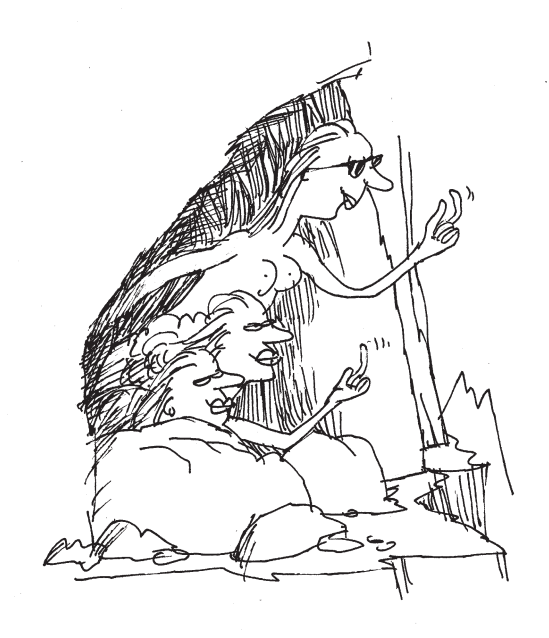
Kind Cunina's chthonic cavity, Cavern sacred to depravity Succours in its covered nooks, Cowards, creeps and cunning crooks; Craving sanctuary and care, Outcasts seek protection there.

The C sound implies a cautious, circumspect approach to the oracular catacomb, as in crawl, creep, cringe and cower. This type of motion is associated with low types, crooks, creeps, craven cowards, cranks, criminals and corrupt occultists.