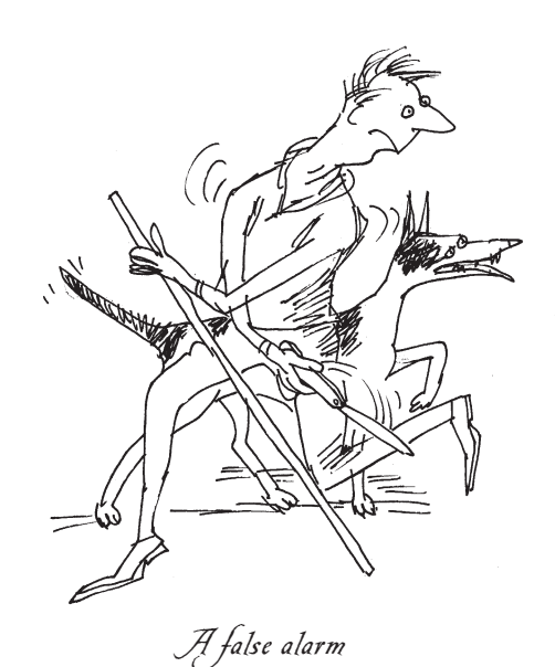
Quick, Jack! Wake up and act! Pick up your walking-stick! Look, we're attacked! Good luck and be plucky! They're wicked and slick, But poking and tickling them may do the trick. Alick, you brick, you take the stick, Unbuckle your flick-knife and cut them off quick! But hark! there's no tinkling of muskets or tanks. Despicable trickster! It's one of your pranks.

The trivialising effect of K is apparent in knick-knacks, kick-shaws, brica-a-brac, trinkets, keepsakes, crackpots, fickle chicks and gimcrack sparklers, tinkling, twinkling and flickering. Names of small sharp or stinging things tend to be built on the K sound, hence pick, pike, prickle, spike, beak, stick, crop, cane, icicle and flick-knife. Other cutting instruments are listed under C. With these are administered short, sharp chastisements, generally minor: spank, shake, smack, crack, whack, hack, yank, attack, tweak, jerk, peck, wreck, break, kick, nick, flick, prick, lick, tick-off, tickle, poke, sock, rock, knock.