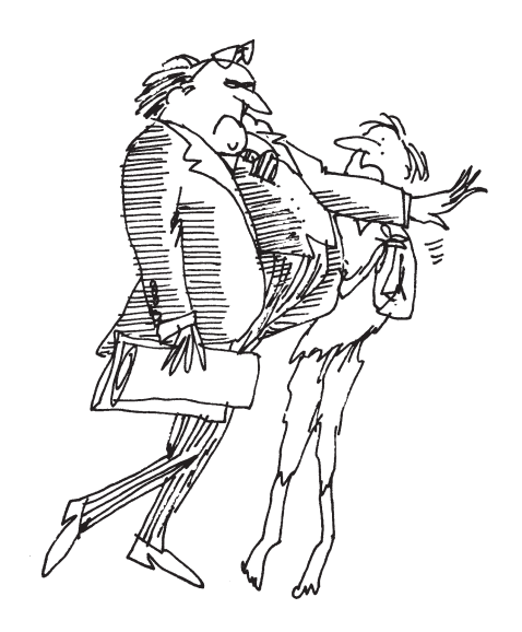
Papa is a prime politician And proud of his powerful position. When people implore his support for the poor He spurns and pooh-poohs their petition.

Papa, the President, the principle personage in our Republic, proudly parades his powerful troops past the imperial palace, prinking and preening in peacock plumes and prancing importantly on his prize palfrey.