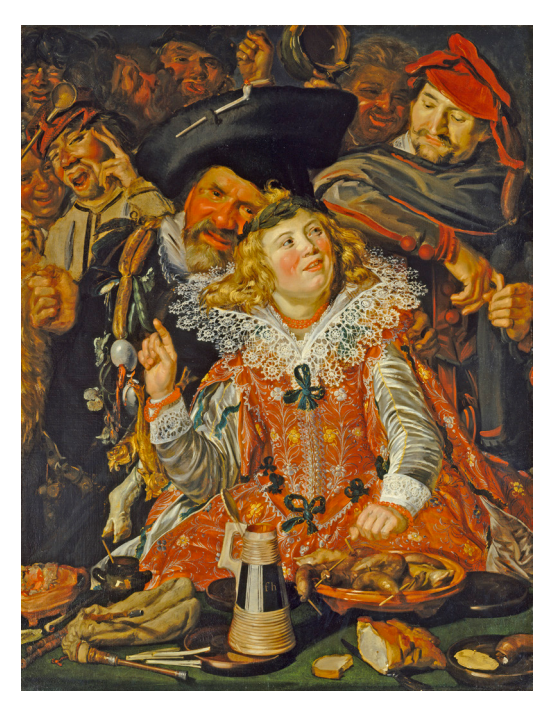
Figure 3 Frans Hals. Merrymakers at Shrovetide (ca. 1616–17). Oil on canvas, 51 % × 39 % in. Metropolitan Museum of Art, New York. Credit Line: Bequest of Benjamin Altman, 1913.

of the sensuality and idiosyncratic finitude of individual experience is so "non-ideal" that the painting is almost grotesque—an exposure to the intimate reality of human subjectivity that typically stays "in private." Further, the thick impasto gives the surface an unrefined and almost "fleshy" appearance, in contrast to the smooth and austere polish of, for example, a portrait by da Vinci—indeed, one might even refer to the image's "texture," to communicate the way the painting seems to appeal as much to touch as to sight. This celebration of the unadorned sensuality of human individuals is perhaps taken to its most intense form in Jan Steen's The Dissolute Household (c. 1663–64) (Figure 4).