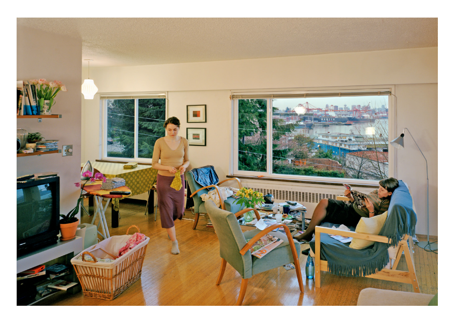
Figure 5 Jeff Wall, A View from an Apartment , 2004–05, transparency in lightbox, 167 \times 244 cm.

material in this small scene: magazines and newspapers strewn on various surfaces; folded and unfolded clothing; various containers (laundry basket, water bottle, vase, tea pot, cups, plant pots); furniture; a TV with accompanying DVDs or video games below it; lights; paintings on the wall; water, ships, trees, buildings, and electrical lines outside. The scene inside is very full; all of the surfaces are in use, whether they are occupied by people or by things. And the scene outside, similarly, is highly developed and articulated: in the distance we see an urban center with high rises, cranes, a harbor, and ships, a city with its implied urban activities and industries, and also with the means for interaction and communication with the outside world. Closer to the window, the electrical wires show the connection of the apartment to an organized system of utilities, and the tree reminds us that the world outside is also natural, that the apartment is embedded in a natural world. The title of the artwork identifies the interior we are seeing as the interior of an apartment, implying the nearby character of other apartments and their inhabitants. This is a highly developed and mediated space; there is a lot of information in it, so to speak—information about the layers of experience, about the phenomena that lend themselves as means to a functional human existence, about the world outside of the apartment by which it is situated.