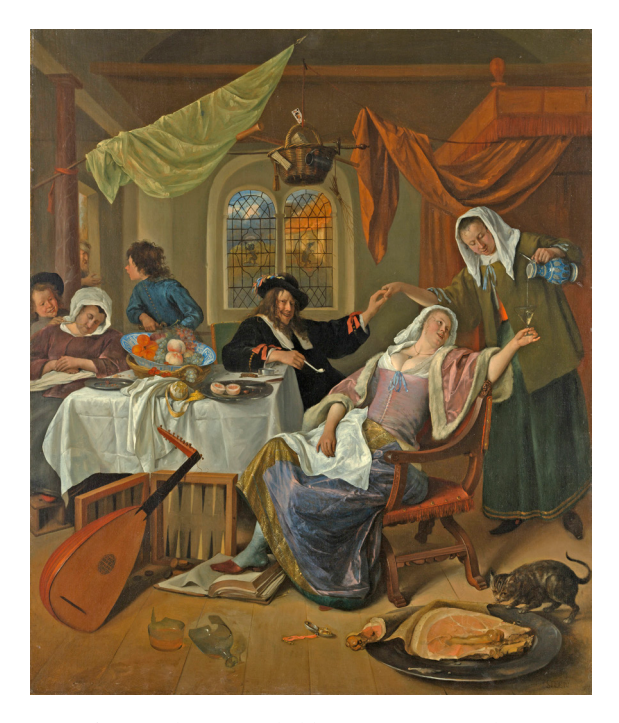
Figure 4 Jan Steen. The Dissolute Household (ca. 1663–64). Oil on canvas, 42 \frac{1}{2} \times 35 \frac{1}{2} in. The Metropolitan Museum of Art, New York. Credit Line: The Jack and Belle Linsky Collection, 1982.

recognize is that they are all themselves species of the Christian interpretation of our human nature—the very recognition worked out in and through the developments in romantic art.