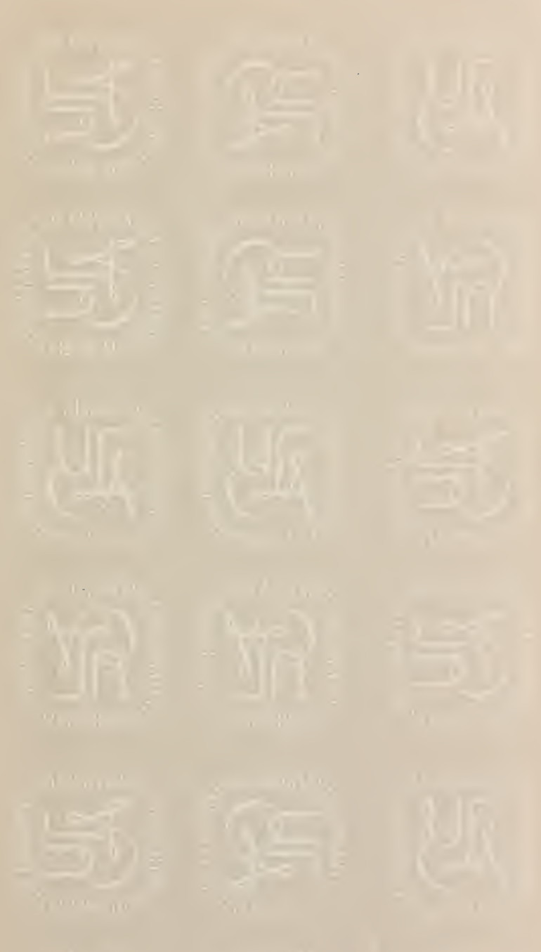
Univ Calif - Digitized by Microsoft ®