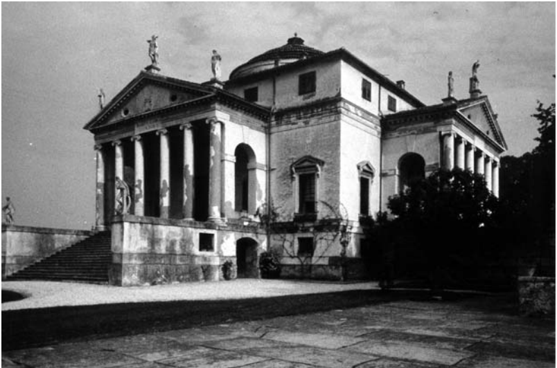
Andrea Palladio, Villa Rotonda, Vicenza, Italy, 1560s