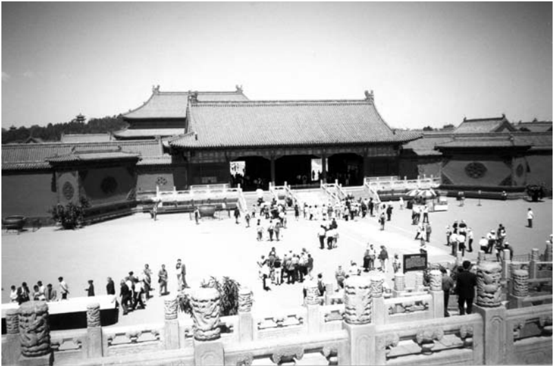
Forbidden City, Beijing, 1368–1644