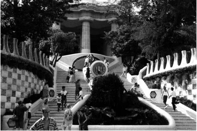
Antoni Gaudí, Parc Güell, Barcelona, 1900s–1910s