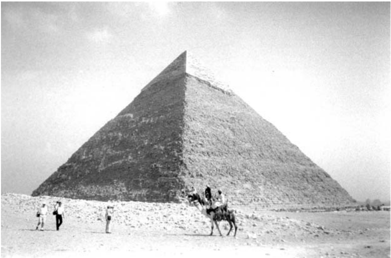
Pyramids at Giza, outside Cairo, Egypt, c. 2500 BC