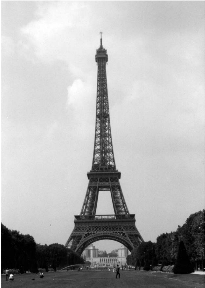
Gustav Eiffel, Eiffel Tower, Paris, 1889