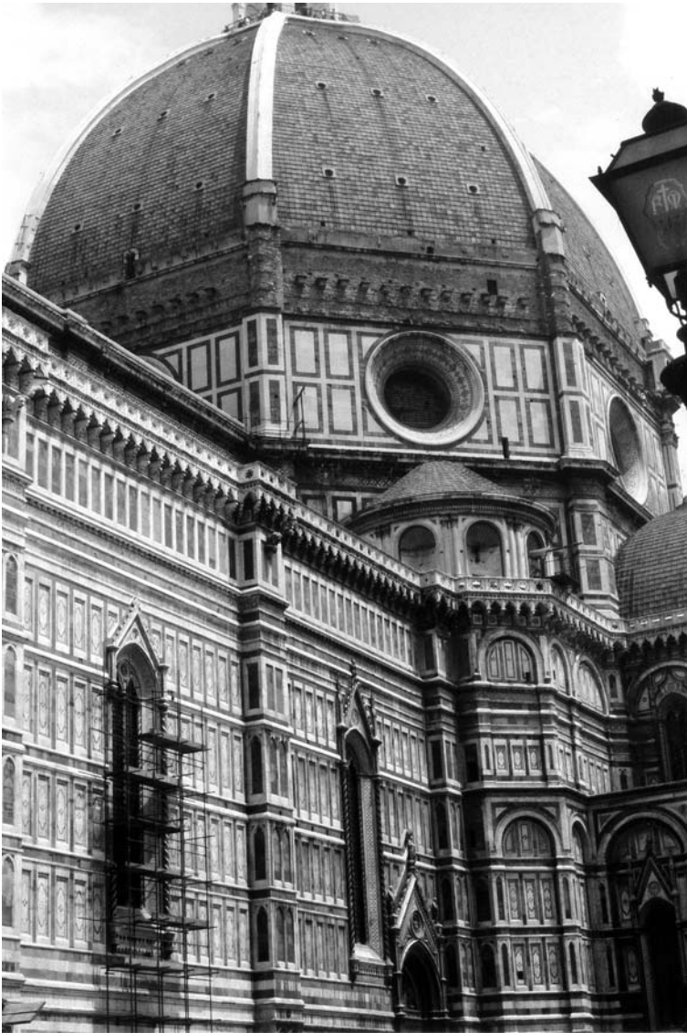
Florence Cathedral, dome by Filippo Brunelleschi, 1420s