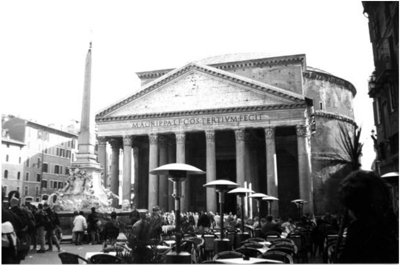
Pantheon, Rome, AD 128