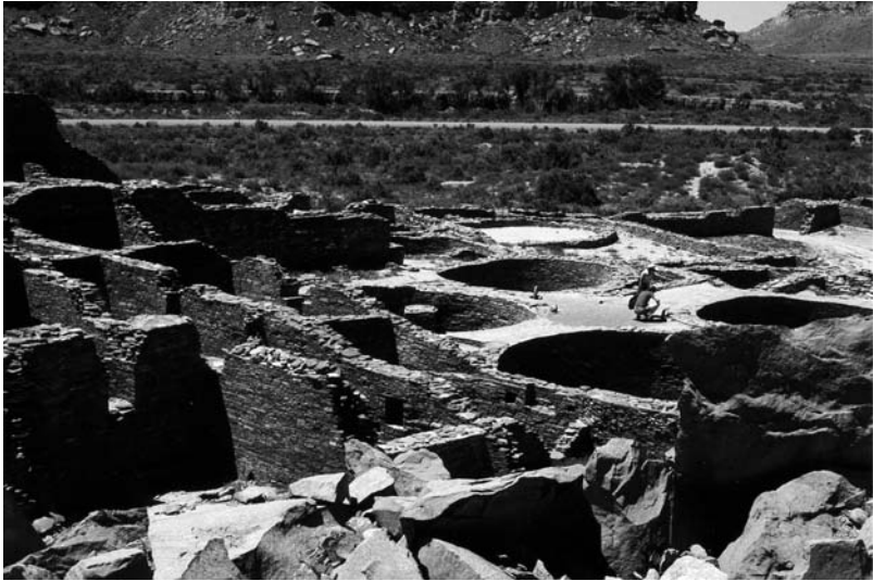
Anasazi "Great House" foundations, New Mexico, 900s–1400s