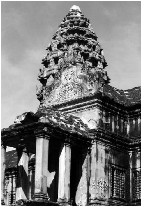
Angkor Wat, Angkor, Cambodia, AD 800s–1200s