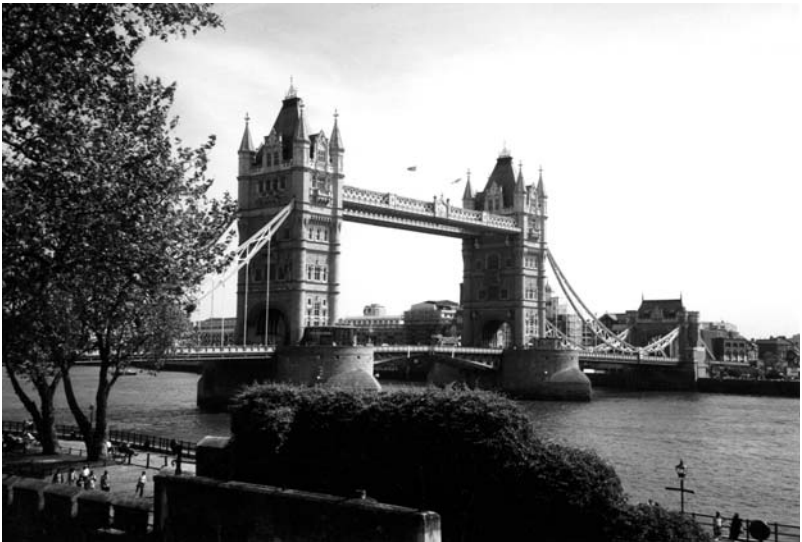
John Barry and Horace Jones, Tower Bridge, London, 1886–1894