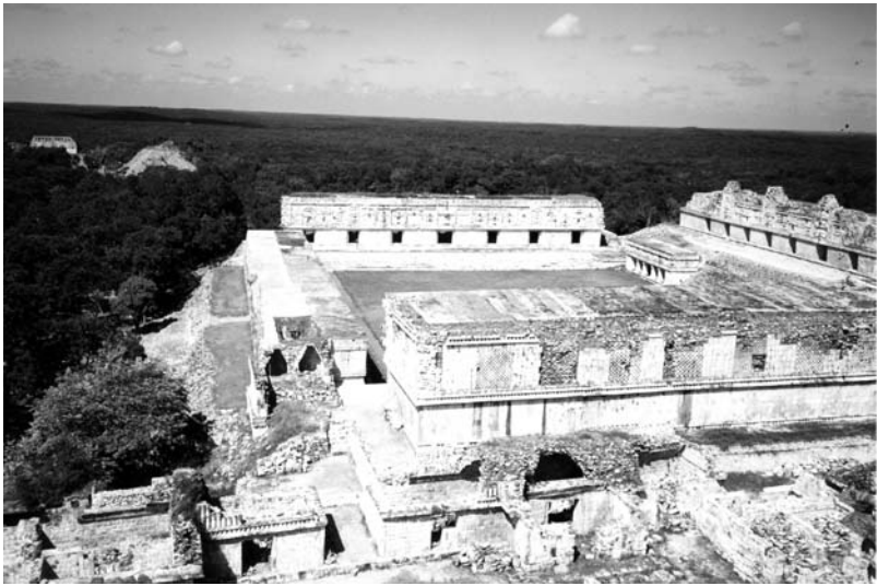
Uxmal Ceremonial Center, Mexico, 800s–1200s