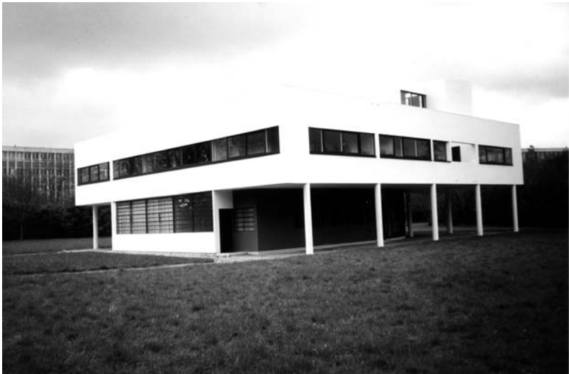
Le Corbusier, Villa Savoye, Poissy-sur-Seine, 1929