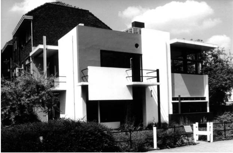
Gerrit Rietveld, Schroeder House, Utrecht, 1924