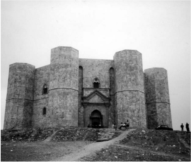
Castel del Monte, Puglia, 1240