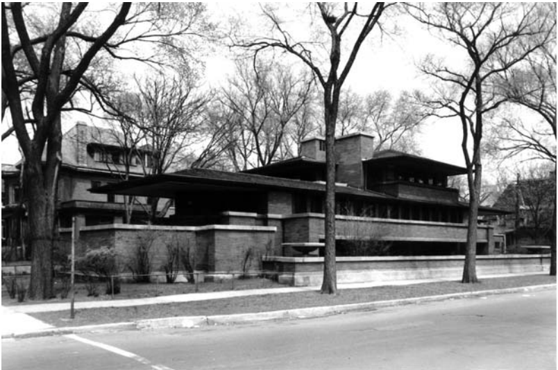
Frank Lloyd Wright, Robie House, Chicago, 1909