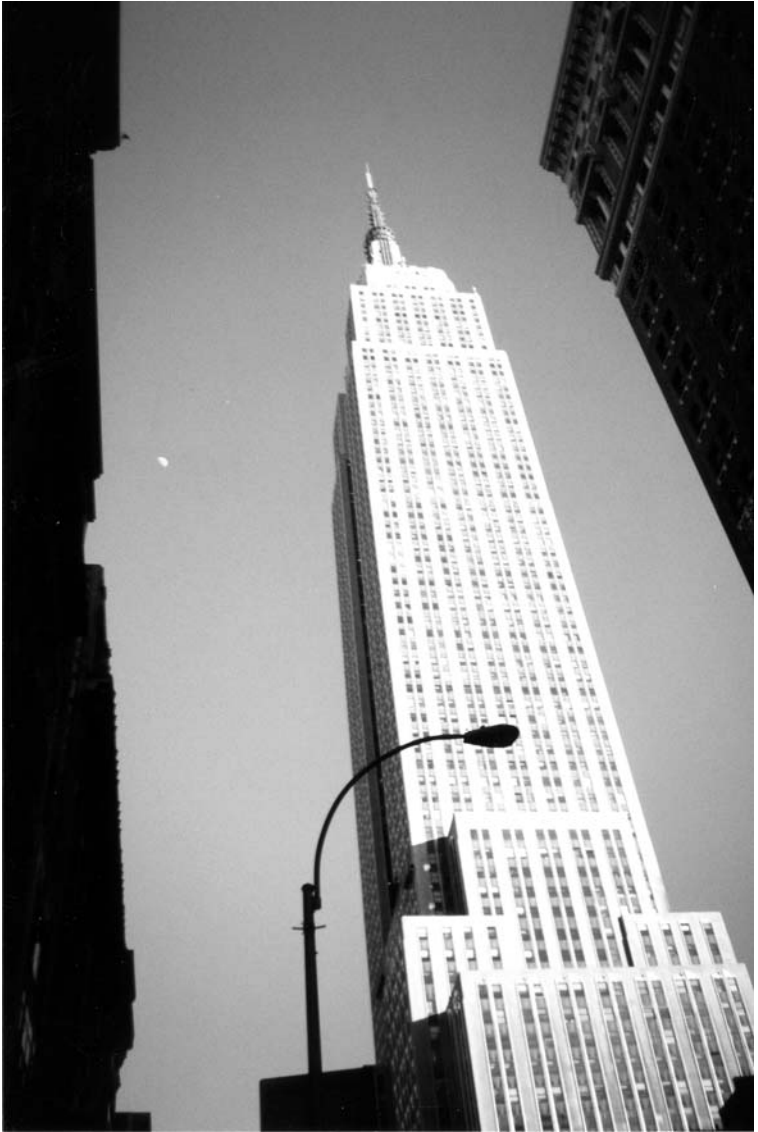
Shreve, Lamb, and Harmon, Empire State Building, New York, 1930s