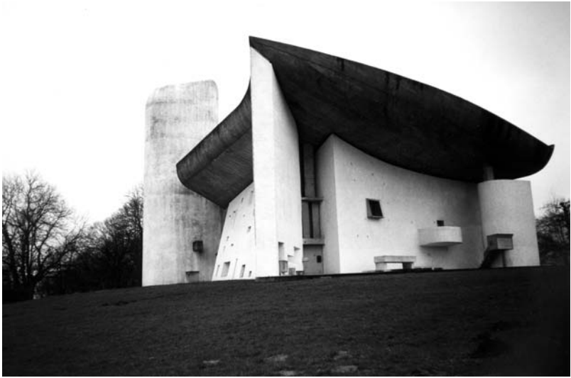
Le Corbusier, Notre Dame du Haut, Ronchamp, 1955