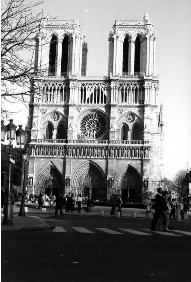
Notre Dame, Paris, 1200s