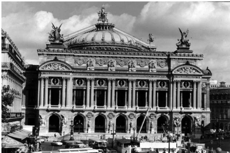
Charles Garnier, Opéra, Paris, 1860s