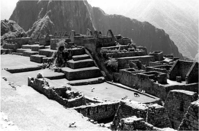
Machu Picchu, Peru, 1450s