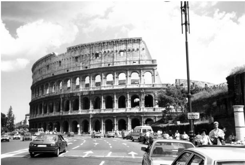
Colosseum, Rome, AD 72–80