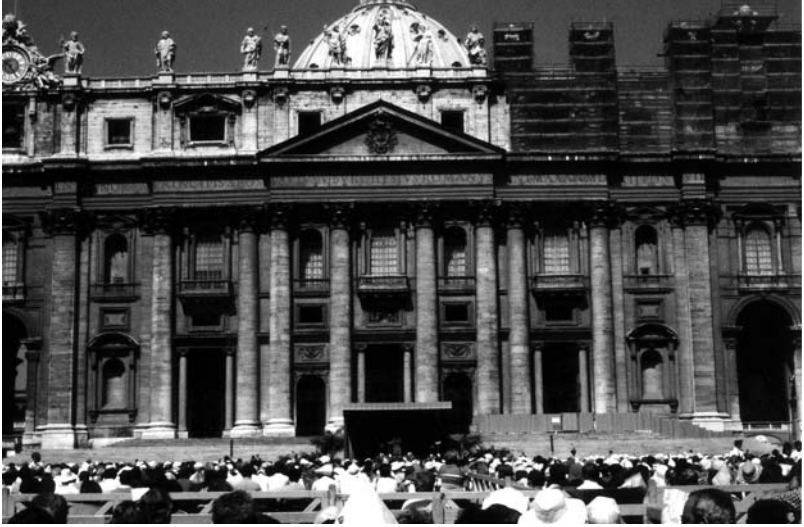
Saint Peter's Church, Rome, begun 1505