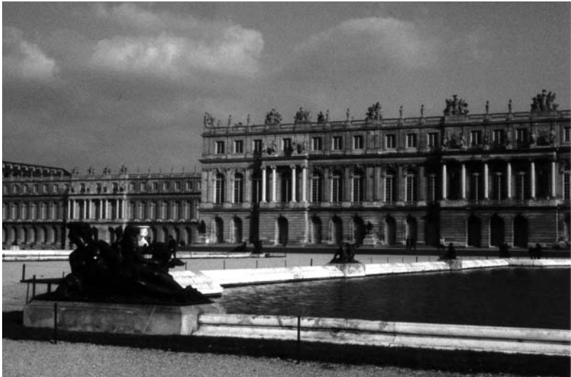
Louis Le Vau, Versailles Palace, Versailles, 1660s