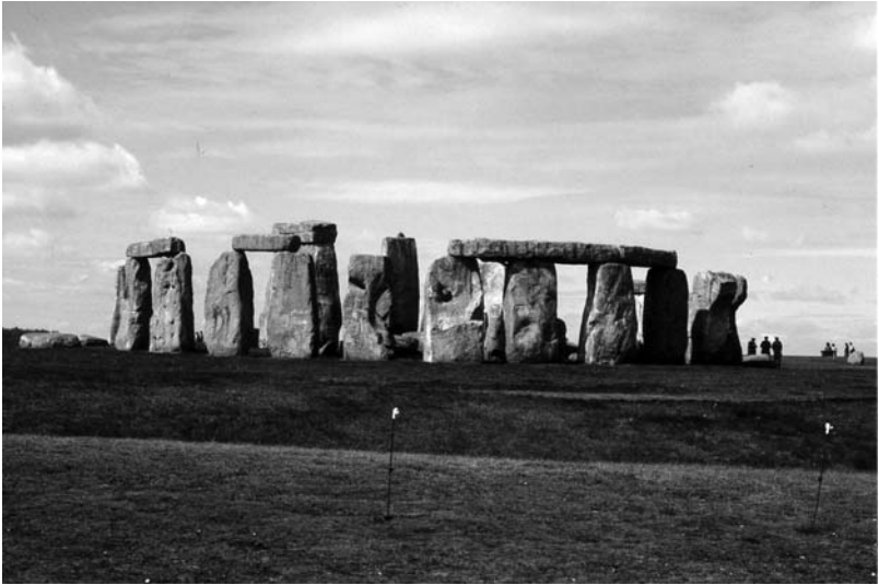
Stonehenge, Salisbury Plain, England, c. 3100–1500 BC