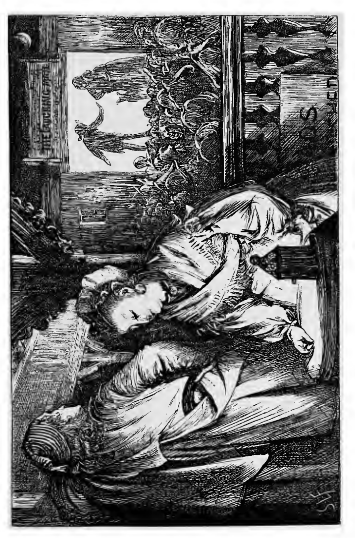
Downloaded from https://www.holybooks.com