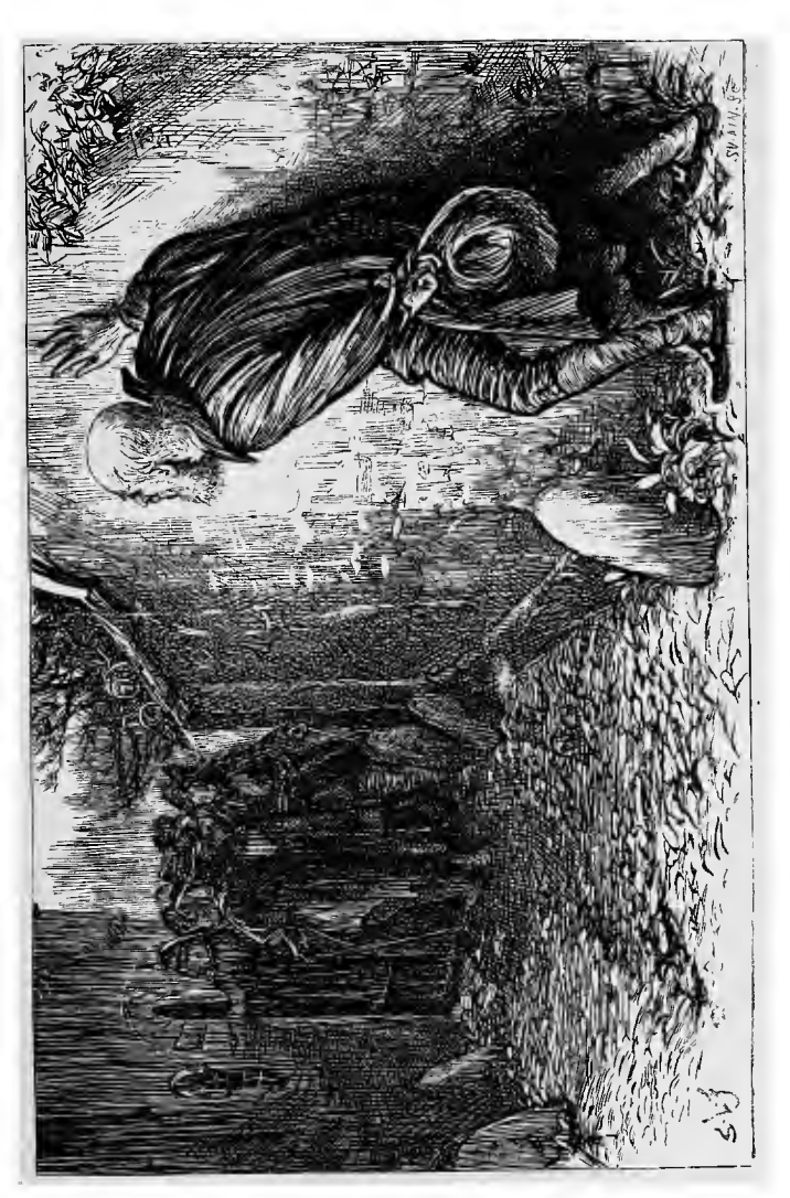
Downloaded from https://www.holybooks.com