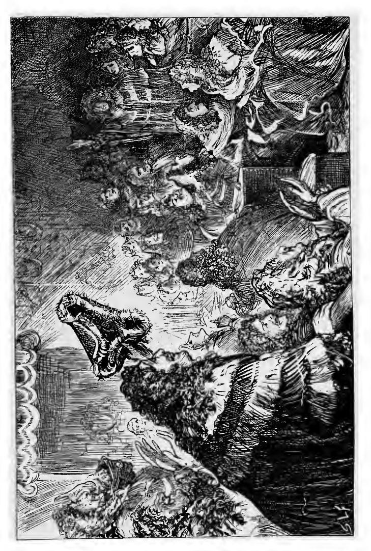
Downloaded from https://www.holybooks.com