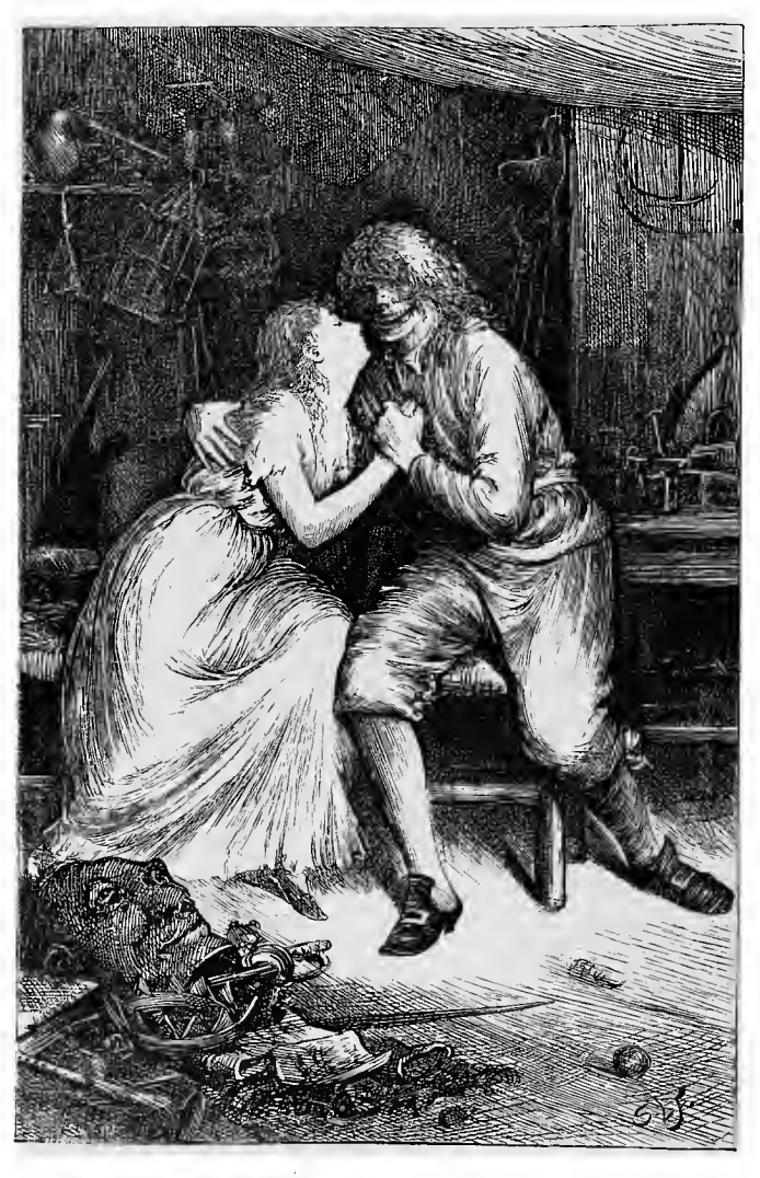
GWYNPLAINE AND DEA.