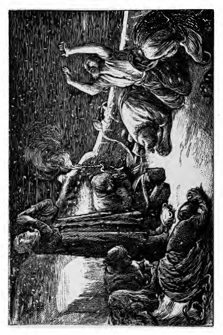
Downloaded from https://www.holybooks.com