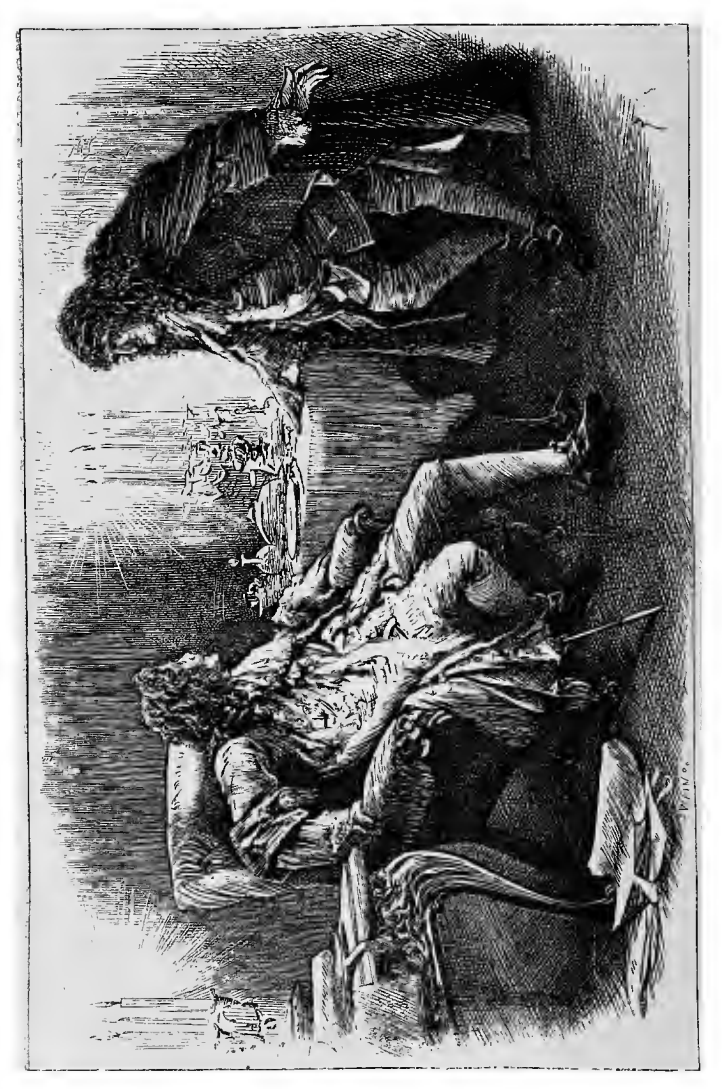
Downloaded from https://www.holybooks.com