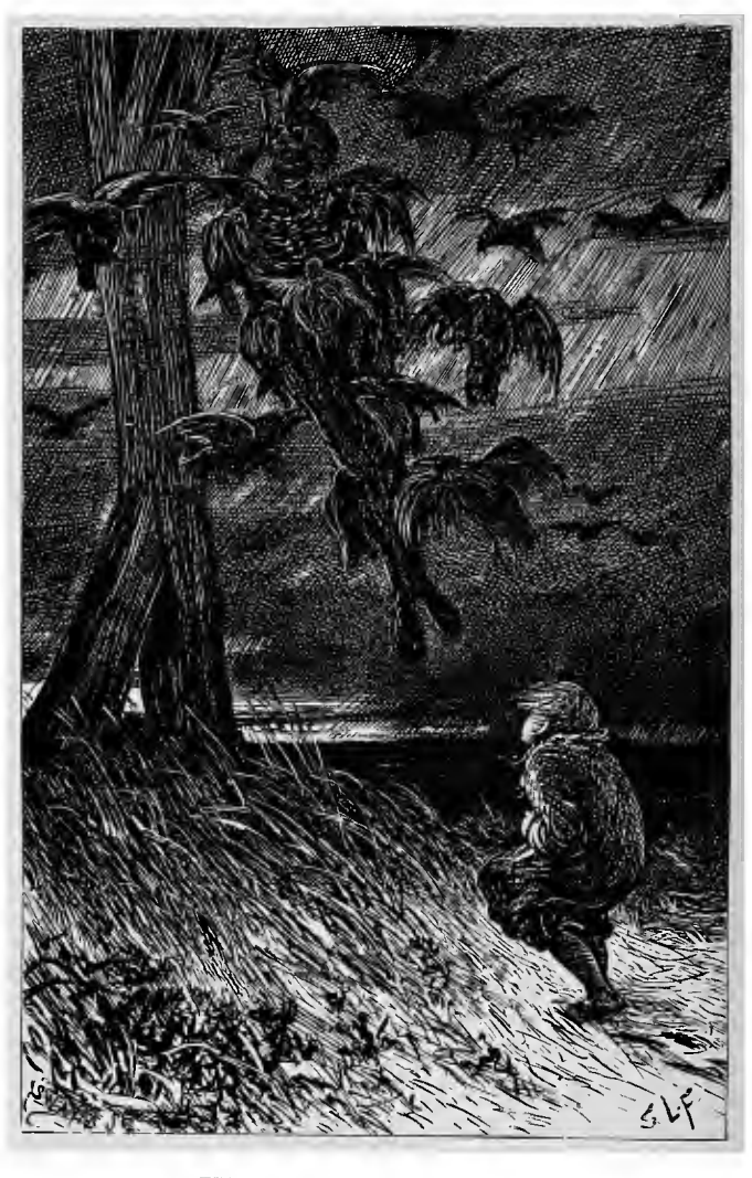
THE TREE OF HUMAN INVENTION.

Downloaded from https://www.holybooks.com