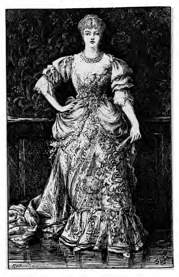
THE DUCHESS JOSIANA,

Downloaded from https://www.holybooks.com