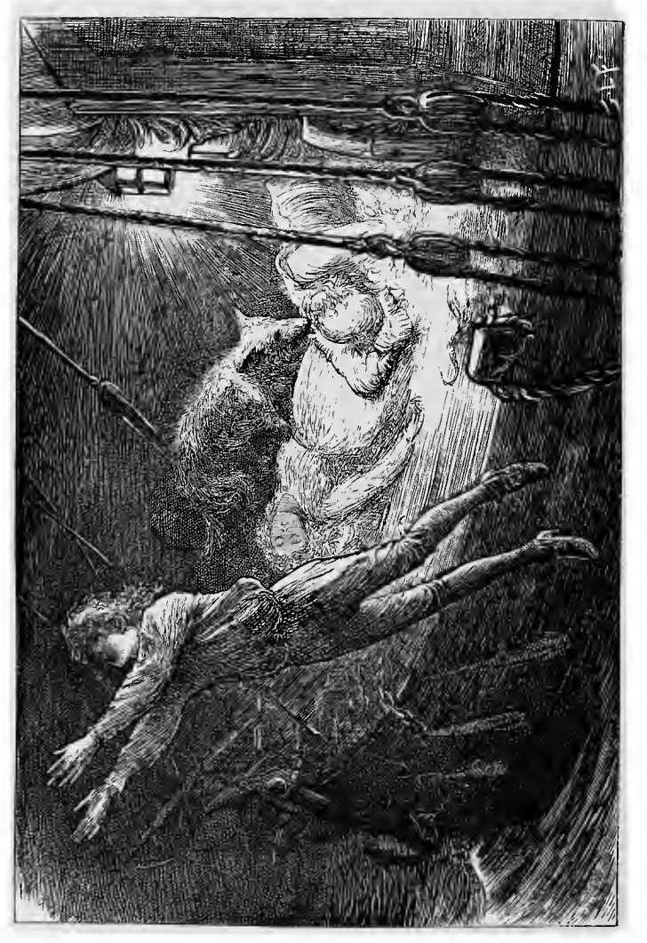
Downloaded from https://www.holybooks.com