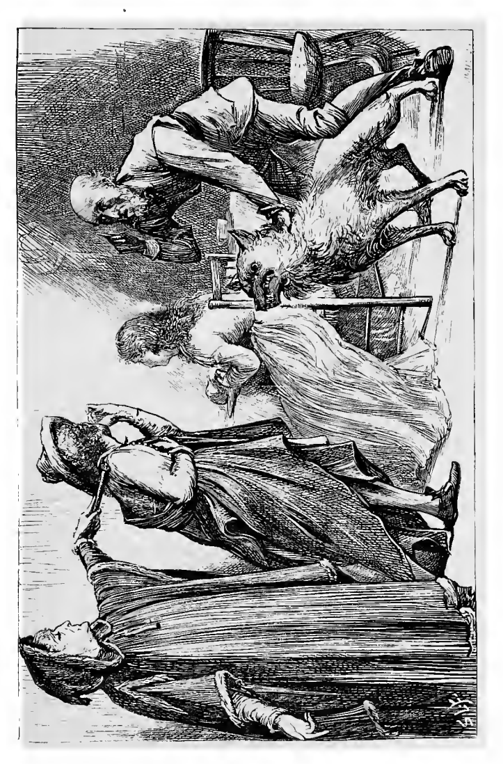
Downloaded from https://www.holybooks.com