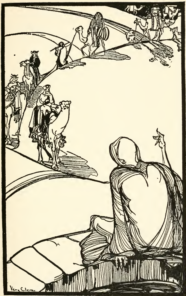
THE DROUGHT SAW A GREAT CARAVAN COME MARCHING TOWARD THE HILL