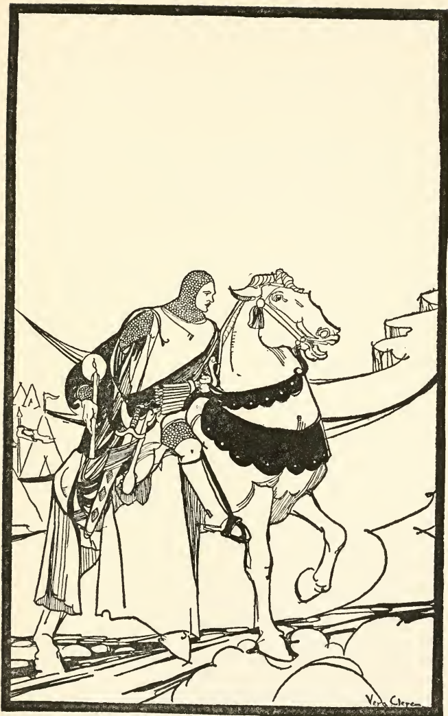
RANIERO RODE FORWARD AS IN A WHITE NIGHT