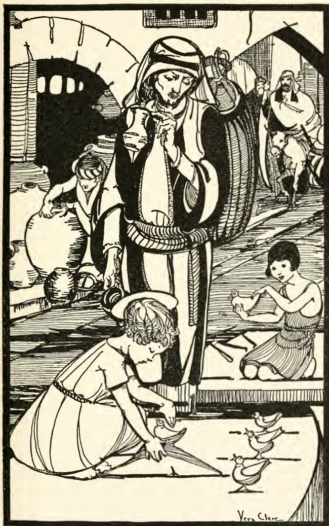
JESUS SAT ON THE DOORSTEP AND MADE CLAY CUCKOOS