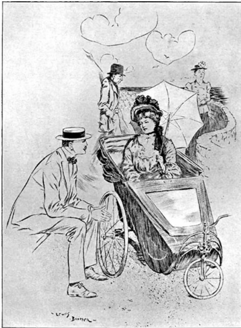
A little group about the Sea Lady's bath chair.

My cousin slackened his pace a little and came up and joined them. The conversation hung at his approach. Chatteris sat back a little, but there seemed no resentment and he sought a topic for the three to discuss in the books Melville carried.