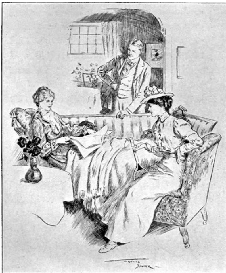
She positively and quietly settled down with the Buntings.

So far I have been very full, I know, and verisimilitude has been my watchword rather than the true affidavit style. But if I have made it clear to the reader just how the Sea Lady landed and just how it was possible for her to land and become a member of human society without any considerable excitement on the part of that society, such poor pains as I have taken to tint and shadow and embellish the facts at my disposal will not have been taken in vain. She positively and quietly settled down with the Buntings. Within a fortnight she had really settled down so thoroughly that, save for her exceptional beauty and charm and the occasional faint touches of something a little indefinable in her smile, she had become a quite passable and credible human being. She was a cripple, indeed, and her lower limb was most pathetically swathed and put in a sort of case, but it was quite generally understood--I am afraid at Mrs. Bunting's initiative--that presently they --Mrs. Bunting said "they," which was certainly almost as far or even a little farther than legitimate prevarication may go--would be as well as ever.