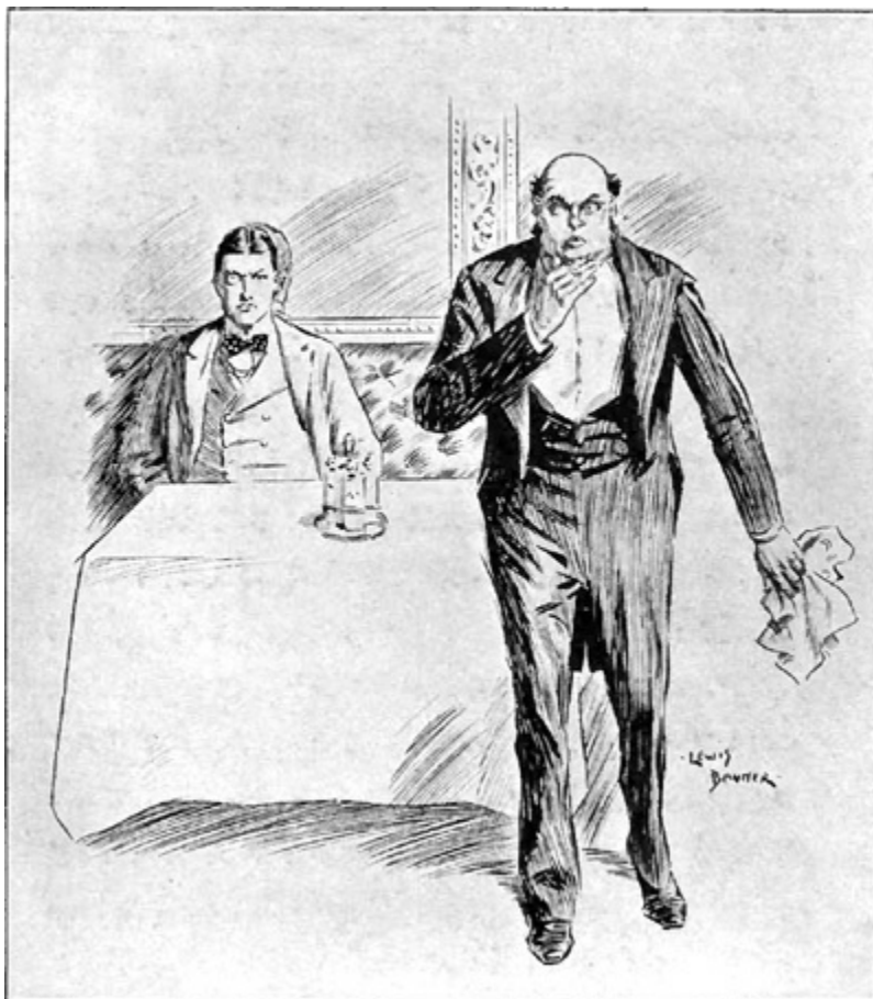
The waiter retires amazed.