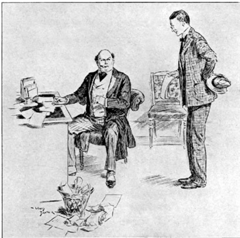
"Stuff that the public won't believe aren't facts."

"I don't care if you had it from--anybody. Stuff that the public won't believe aren't facts. Being true only makes 'em worse. They buy our paper to swallow it and it's got to go down easy. When I printed you that note and headline I thought you was up to a lark. I thought you was on to a mixed bathing scandal or something of that sort--with juice in it. The sort of thing that all understand. You know when you went down to Folkestone you were going to describe what Salisbury and all the rest of them wear upon the Leas. And start a discussion on the acclimatisation of the cafe. And all that. And then you get on to this (unprintable epithet) nonsense!"