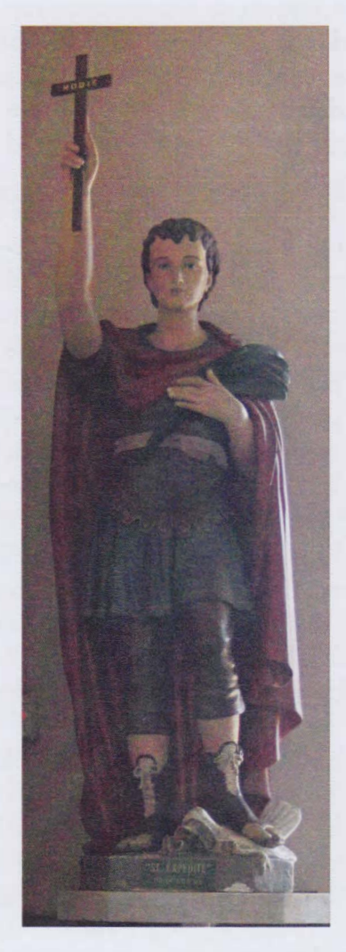
Our Lady of Guadalupe Church, New Orleans. Alcove with statue of St. Expedite.