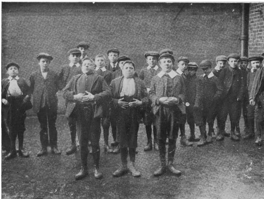
See note on previous illustration.