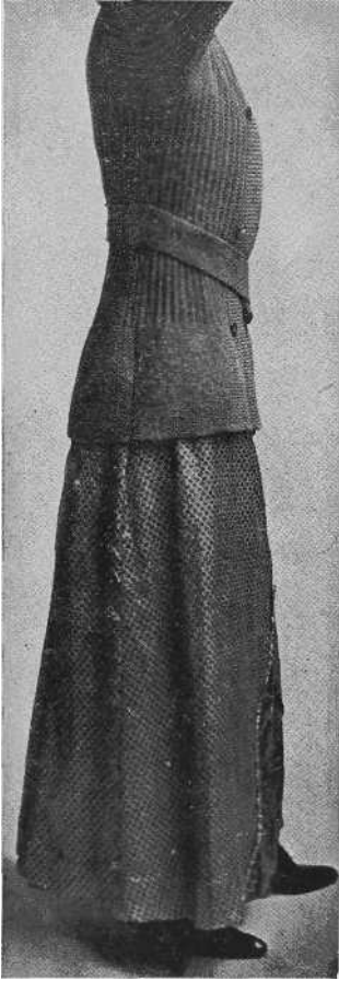
A ( Correct )