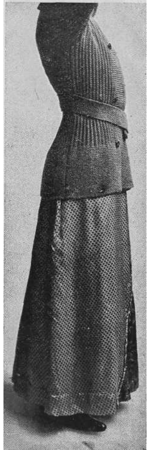
B ( Incorrect )

A —The feet are here placed in the ideal position for obtaining perfect equilibrium of the human machine, and for permitting the maximum activity of the functioning of the whole organism. NOTE.—It is evident that either the right or left foot may be in advance without affecting the correctness of the pose.