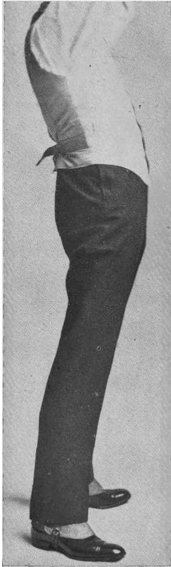
B ( Incorrect )

A —The feet are here placed in the ideal position for obtaining perfect equilibrium of the human machine, and for permitting the maximum activity of the functioning of the whole organism. NOTE.—It is evident that either the right or left foot may be in advance without affecting the correctness of the pose.