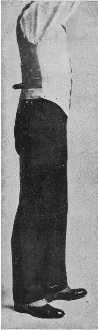
A ( Correct )