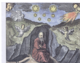
Study Course on alchemical sequences

lessons to be studied on a two weekly schedule. A mass of graphic material and examples of emblems is contained in these lessons.