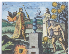
Study Course on alchemical symbolism

A growing suite of courses of instructions and exercises on the interpretation of alchemical symbolism and texts, which focus entirely on European alchemy. These are not correspondence courses, being entirely self contained, and do not require any additional materials. In addition the courses are very modestly priced.