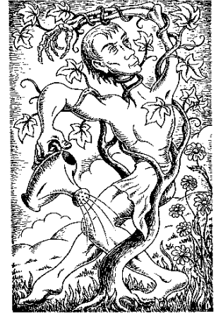
6. THE FOOL