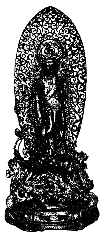
5. AMIDA (BUDDHA AMITABHA.)