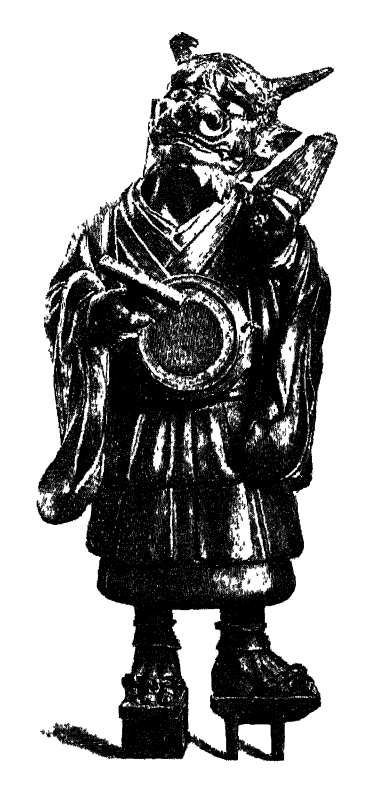
6. THE DEVIL AS A BUDDHISTIC MONK.