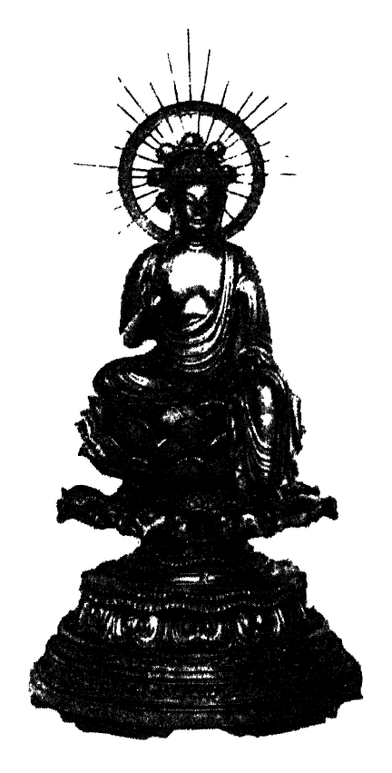
I. MI-RÔ KOU OF MAITREYA.