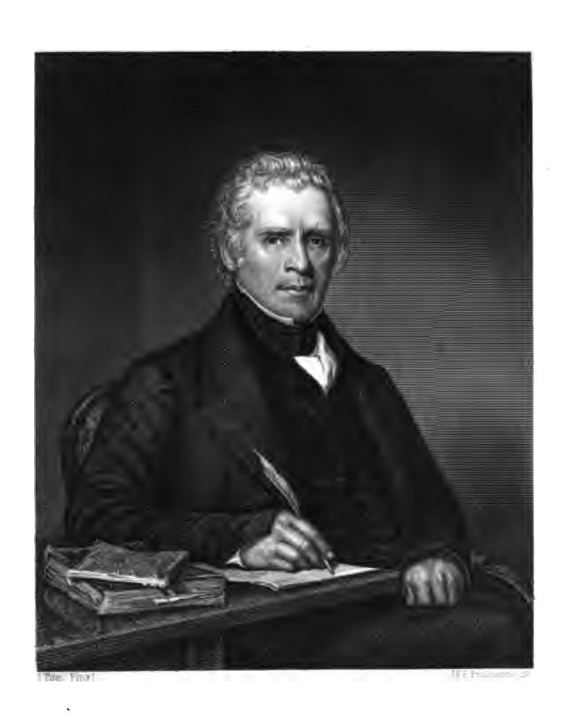
MEST OF MEDICAL COLUMN, IN TO