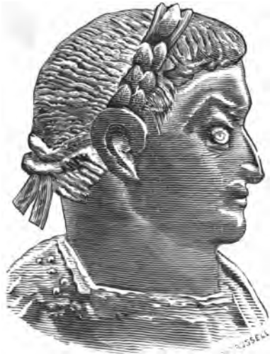
CONSTANTINE THE GREAT.