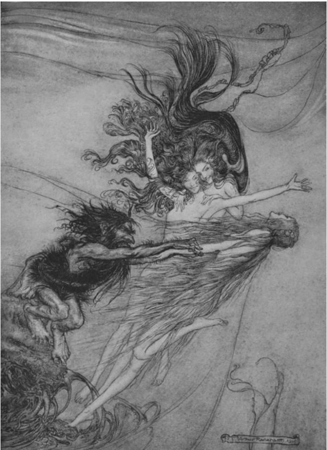
6. Arthur Rackham, 'The Rhinemaidens Teasing Alberich' (1911). The character Alberich in Richard Wagner's The Ring of the Nibelungen has been seen as a cipher of the composer's antisemitic ideology.