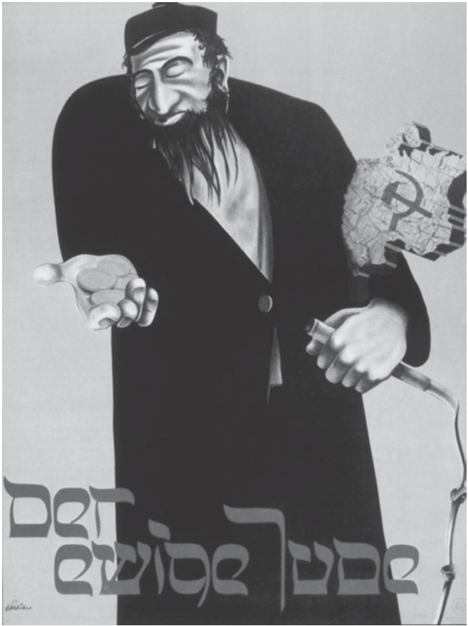
11. 'The Eternal Jew', Nazi poster (1937). Jewish world conspiracy: 'The Jew' has money in one hand, a whip (power) in the other, and the Soviet Union in his pocket.