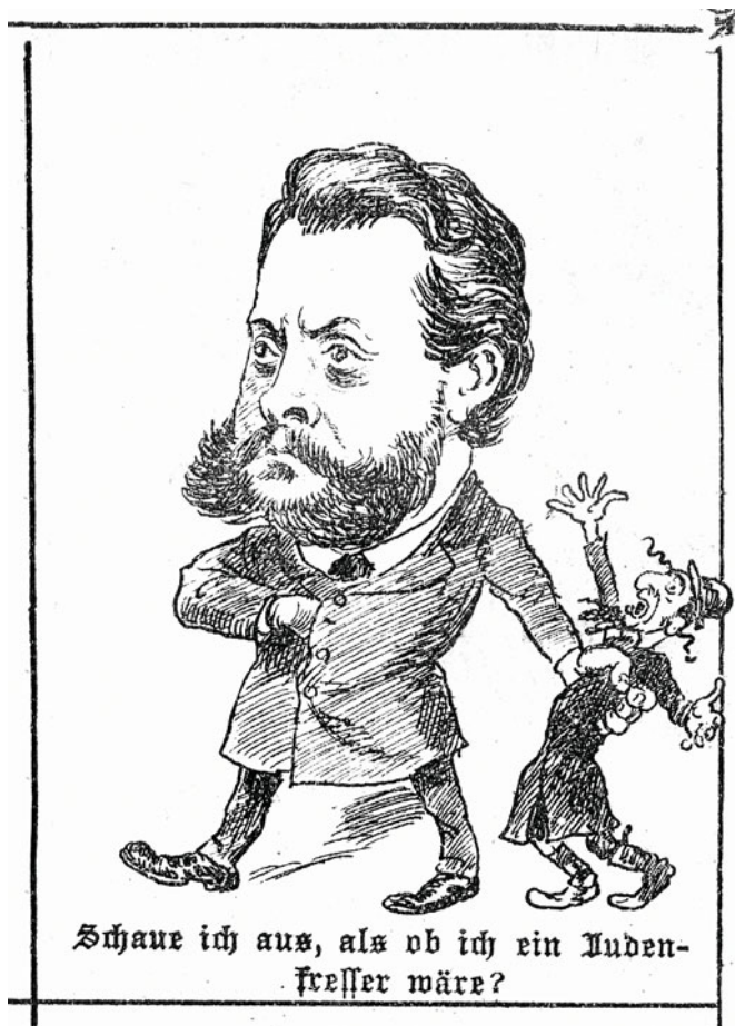
9. 'Do I look like I would eat Jews?', Glühlichter , December 1892. Karl Lueger (1844–1910), Austrian Christian Social leader and mayor of Vienna, was notorious for his cynical opportunism and hypocrisy regarding antisemitism; he was one of Hitler's role models, together with Georg von Schönerer, in Mein Kampf .