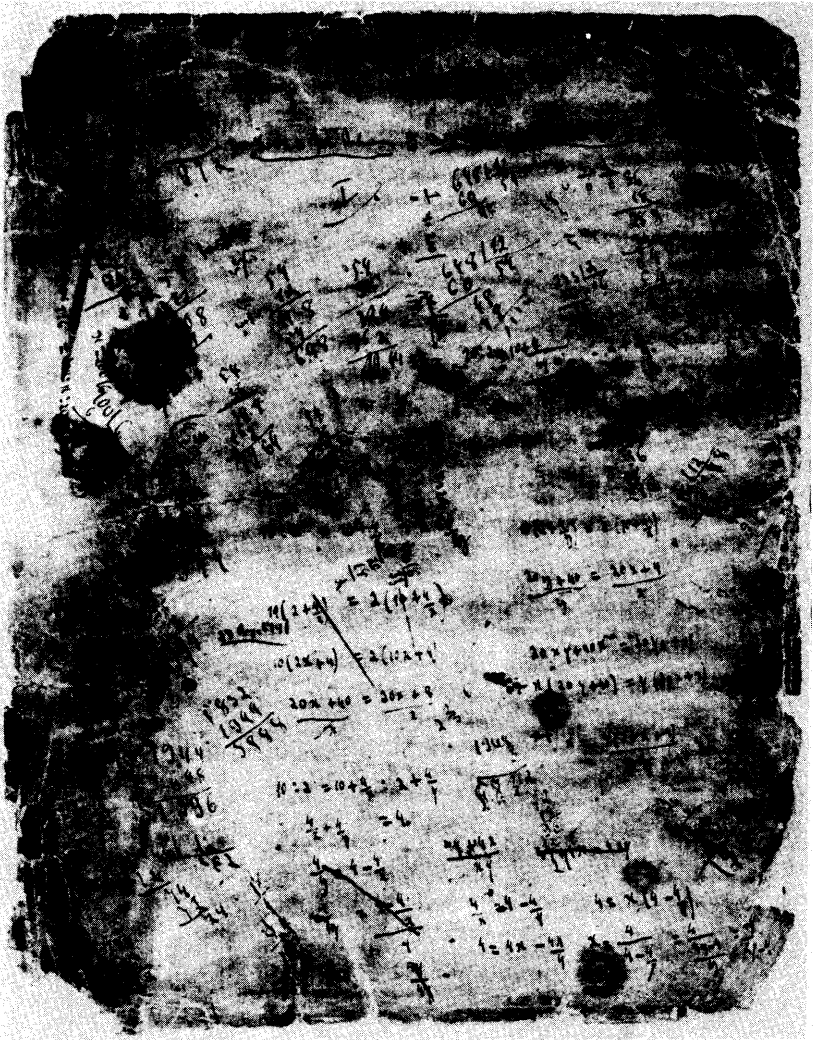
Cover page of Notebook I of the Economic Manuscript of 1861-63