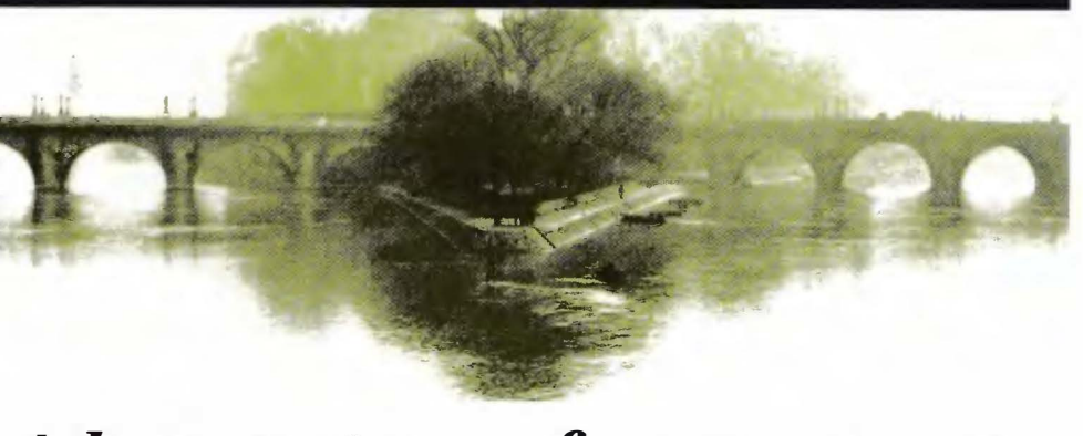
the age of reason