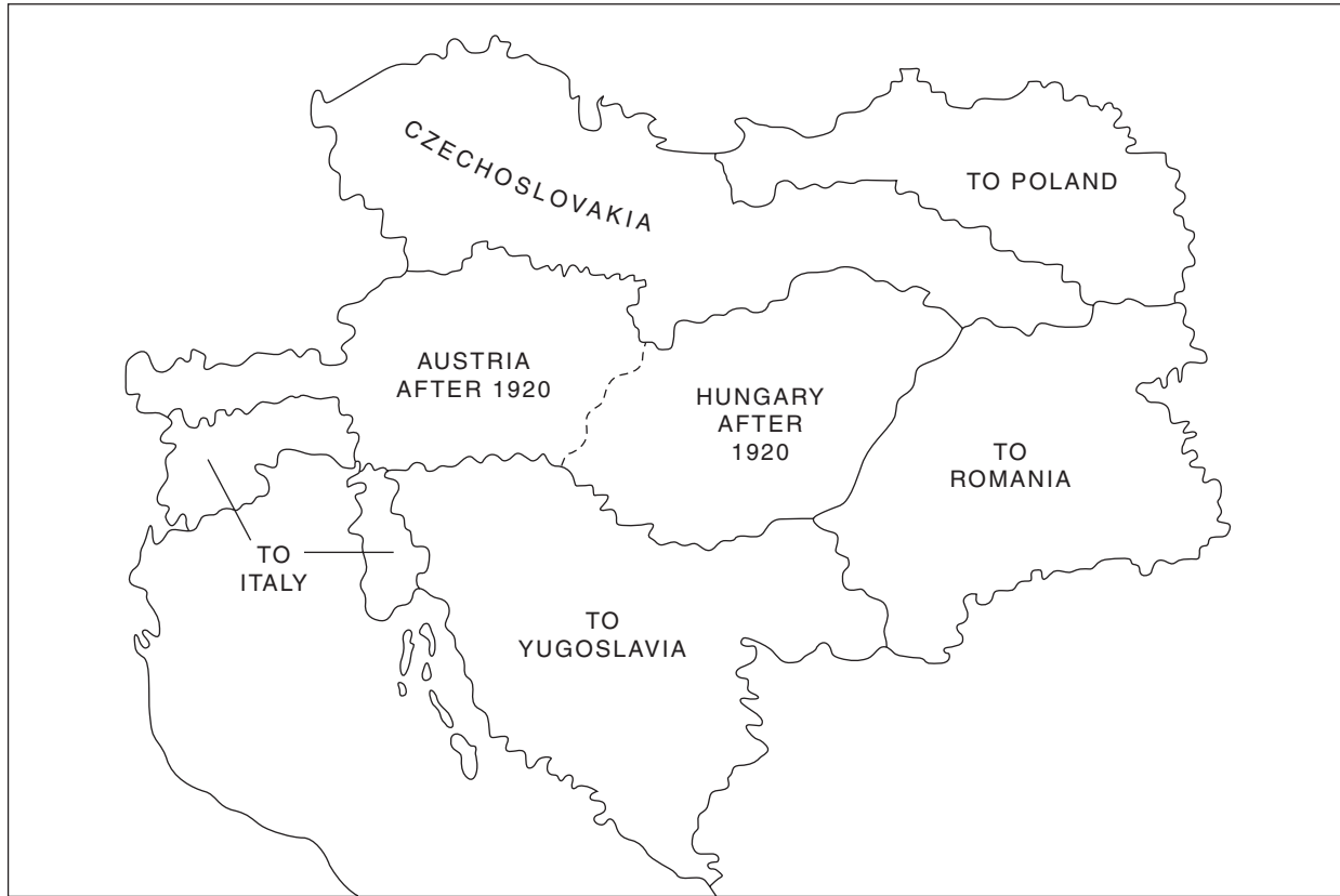
Map 2 The dismemberment of the Austro-Hungarian Empire