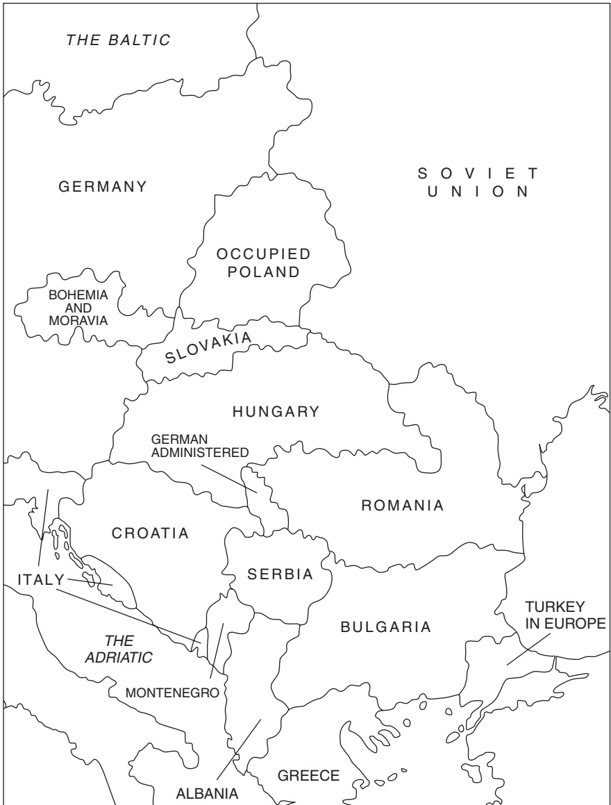
Map 3 Central and Eastern Europe in 1942