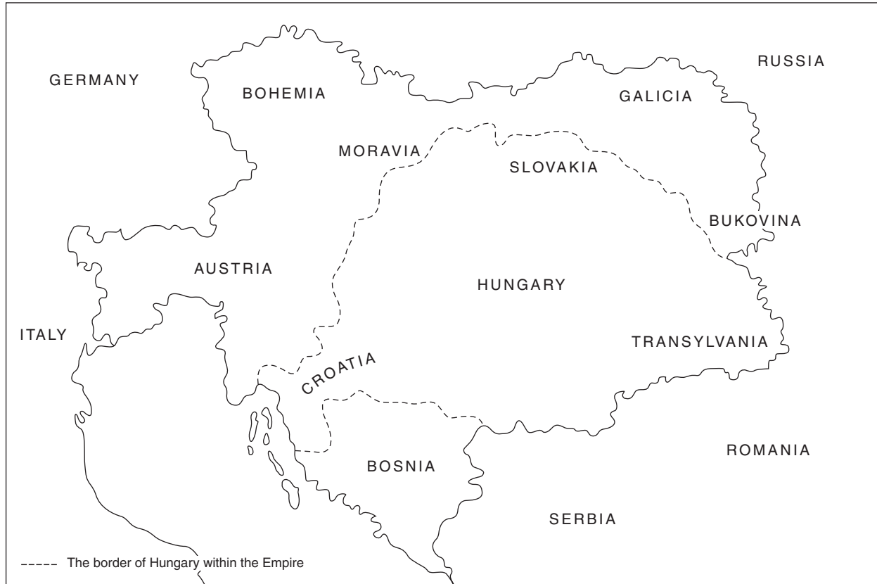
Map 1 The Austro-Hungarian Empire in 1914