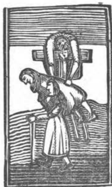
Taken down from the Cross.

hall and kept his estate at the table; in the middle sat the Dean, and those of the king's chapel, who immediately after the king's first course "sang a caroll."— Leland . Collect. vol. iv. p. 237.)—Granger innocently observes that "they that fill the highest and the lowest classes of human life, seem in many respects to be more nearly allied than even themselves imagine. A skilful anatomist would find little or no difference in dissecting the body of a king and that of the meanest of his subjects; and a judicious philosopher would discover a surprising conformity in discussing the nature and qualities of their minds."— Biog. Hist. of Engl. , ed. 1804, vol. iv. p. 356.