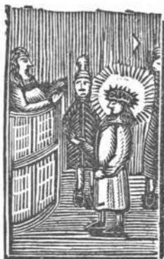
Christ brought before Pilate.

The inscriptions are placed beneath the cuts exactly as they stand in the original sheet.