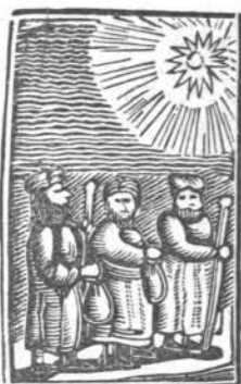
3 Wise Men.