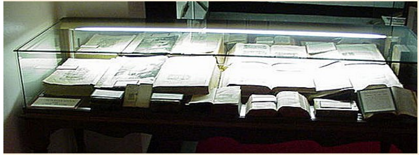
Station 8 - showing a variety of works

This Station shows a number of 16th & 17th Century Bibles, including, among others: