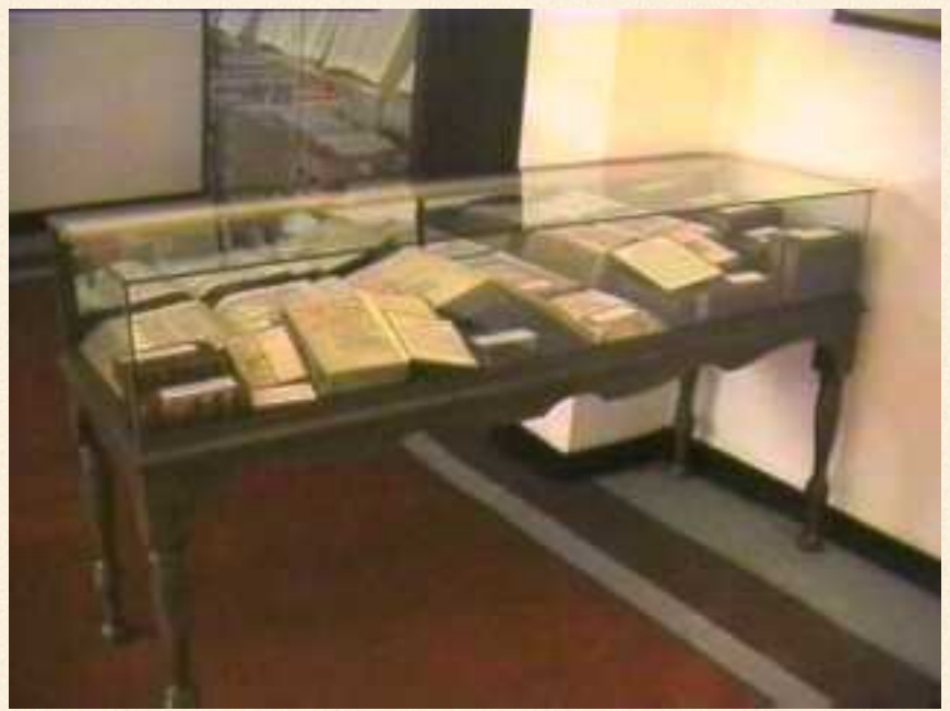
An overview of Station 9 in the "Room of the Book"

This Station shows a number of 16th through 19th Century Bibles, including, among others: