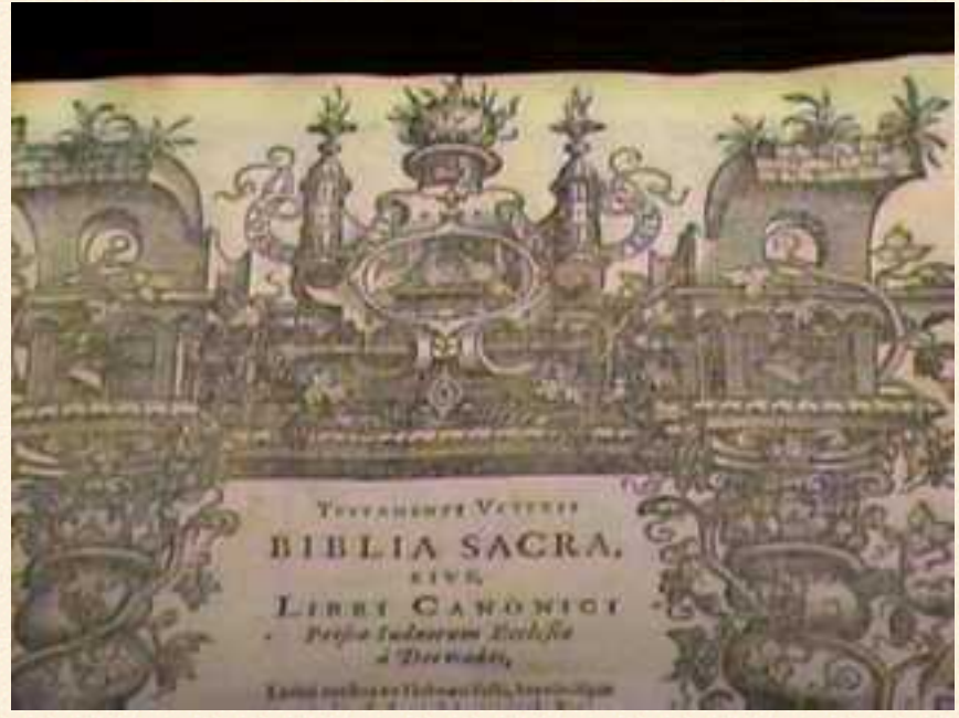
The "final" Vulgate Version