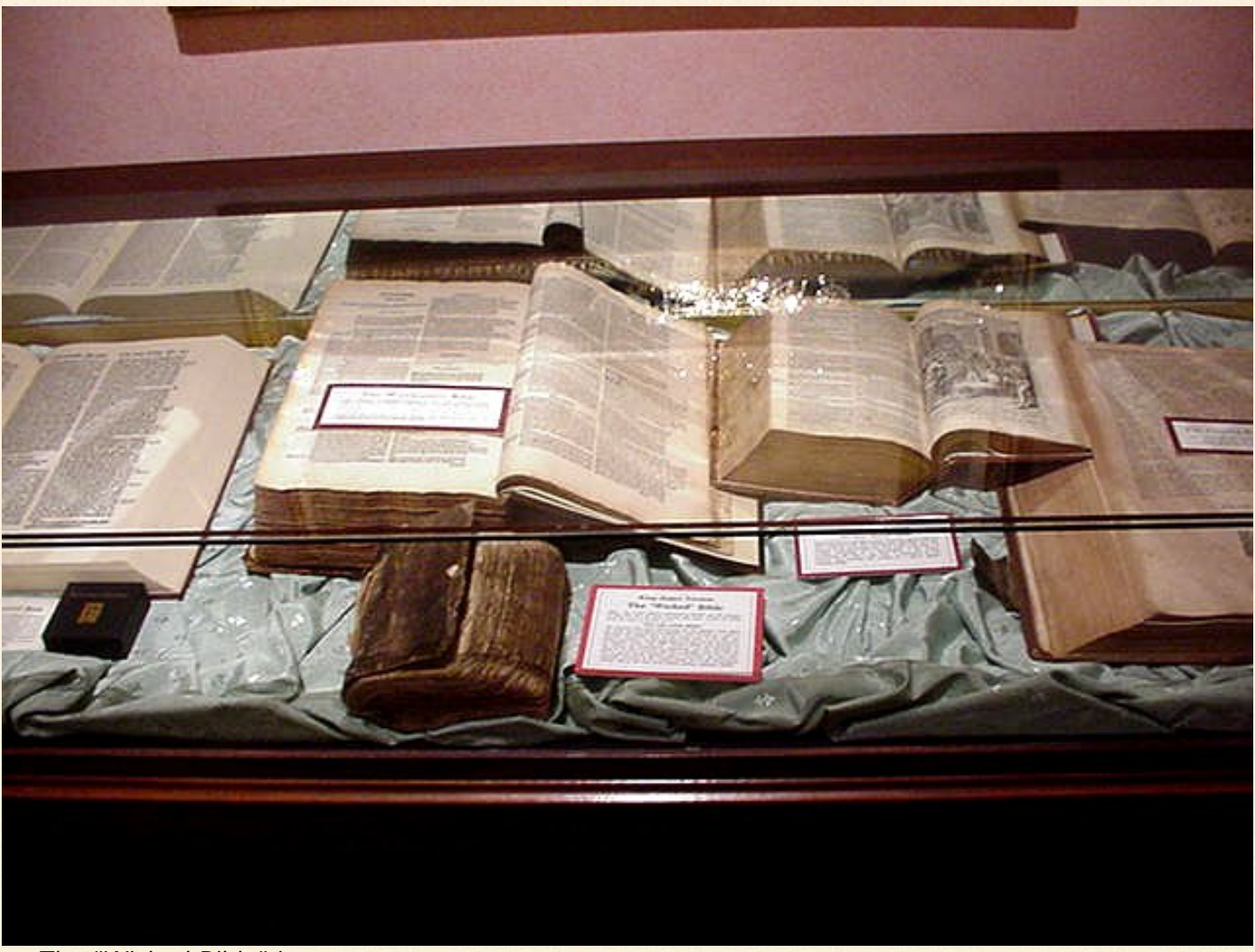
The "Wicked Bible" is at bottom center.